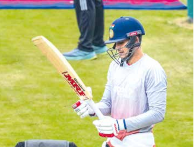
India's Shubman Gill during nets (file photo)

Indian selectors dropped Test and ODI captain Shubman Gill yesterday from the T20 squad for the World Cup in February after a prolonged form slump. Gill, 26, has scored only 291 runs in his past 15 matches in the game's shortest format at an average of 24.25. "Shubman Gill is short of runs at the moment," chief selector Ajit Agarkar told reporters in Mumbai. However, batter Suryakumar Yadav was retained as captain despite similar concerns over his form. A T20 specialist, Suryaku-