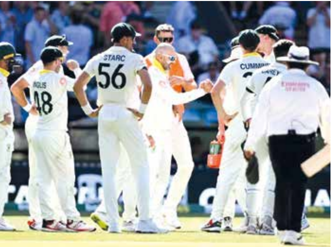
Australia's Nathan Lyon celebrates dismissing England captain Ben Stokes