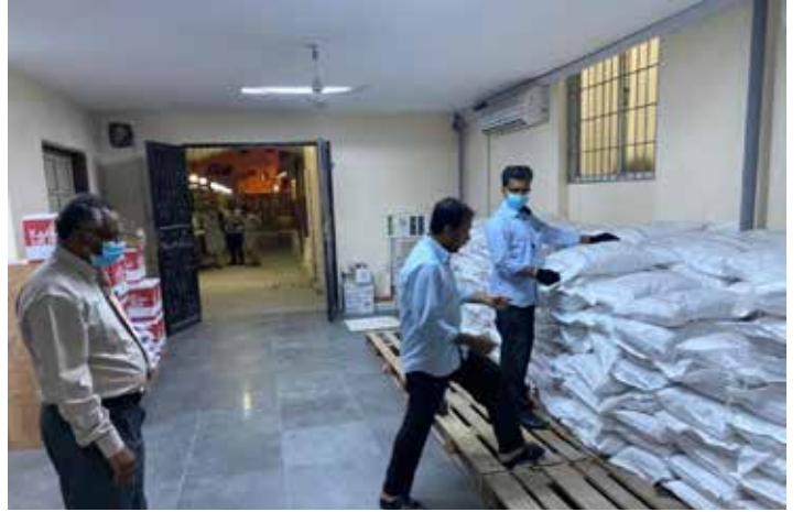
The Chairman of the Board of Directors of the Islamic Society said that His Royal Highness Prince Khalifa bin Salman Al Khalifa's help used to benefit more than 600 families