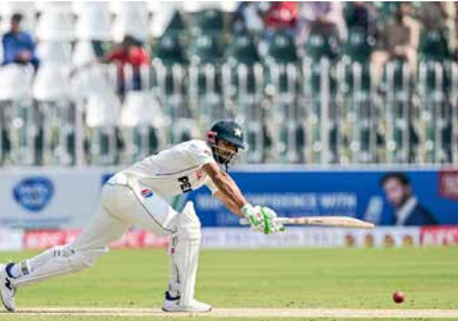
Pakistan's captain Shan Masood plays a shot | Rawalpindi

Pakistan punished poor catching from South Africa to accumulate 259-5 on the opening day of the second and final Test in Rawalpindi on Monday. Had the tourists not dropped five catches on a turning pitch they would have been in a better position after Pakistan won the toss and batted. Skipper Shan Masood, dropped on 71 off a luckless Keshav Maharaj, top-scored with 87 while Abdullah Shafique -- dropped four times -- made 57. Saud Shakeel and Salman Agha will resume on Tuesday unbeaten on 42 and 10