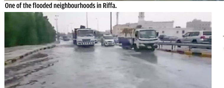
Vehicles wade through flooded roads in Riffa.

Waterlogged roads made drivers struggle. However, no traffic really strong. I had to avoid cer- terday. In one of the videos, a boy accidents were reported from tain roads as they were filled was seen swimming to cross a across the Kingdom.