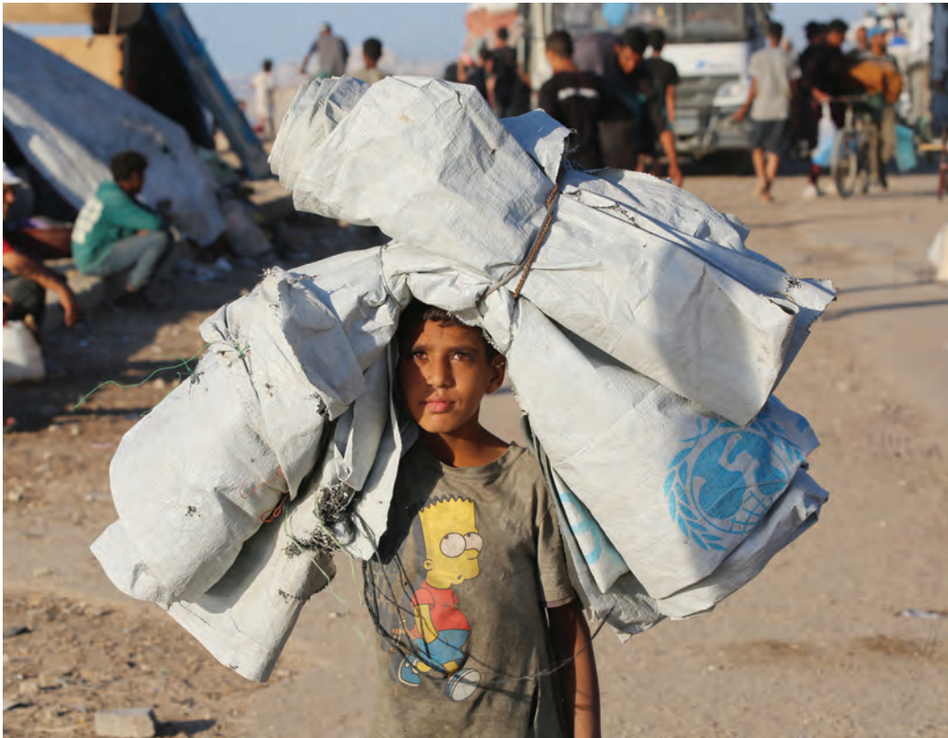
A displaced Palestinian boy carries a tent on his head as he moves southwards on a road in the Nuseirat refugee camp area in the central Gaza Strip, as Israel presses its ground offensive to capture Gaza City.