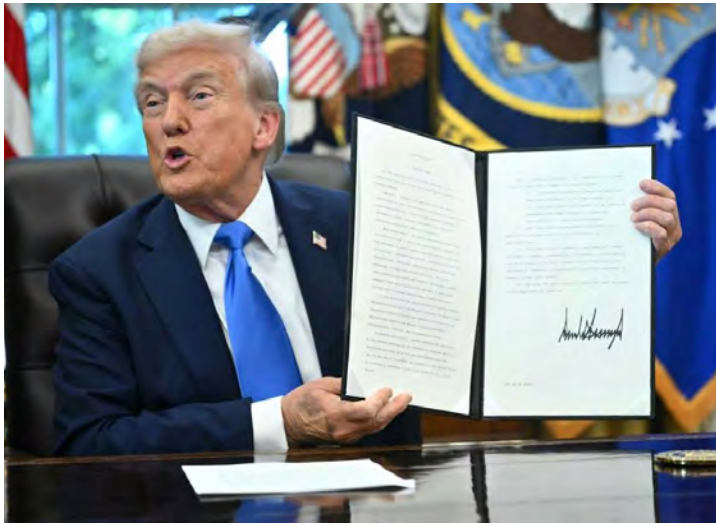
US President Donald Trump displays an executive order he just signed in the Oval Office at the White House in Washington

Such visas allow companies to sponsor foreign workers with specialised skills --- such as scientists, engineers, and computer programmers -- to work in the