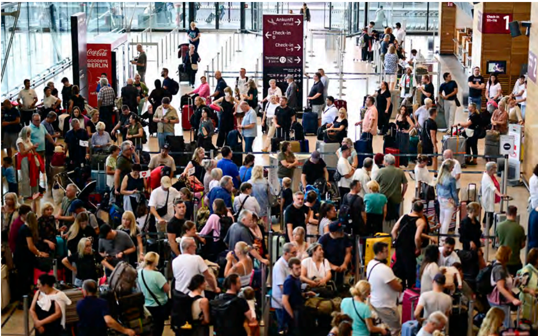
Passengers queue for check-in at Terminal 1 of Berlin Brandenburg BER Airport Willy-Brandt in Schoenefeld

Brussels airport said the attack was still having a "large impact" on flight schedules yesterday morning.