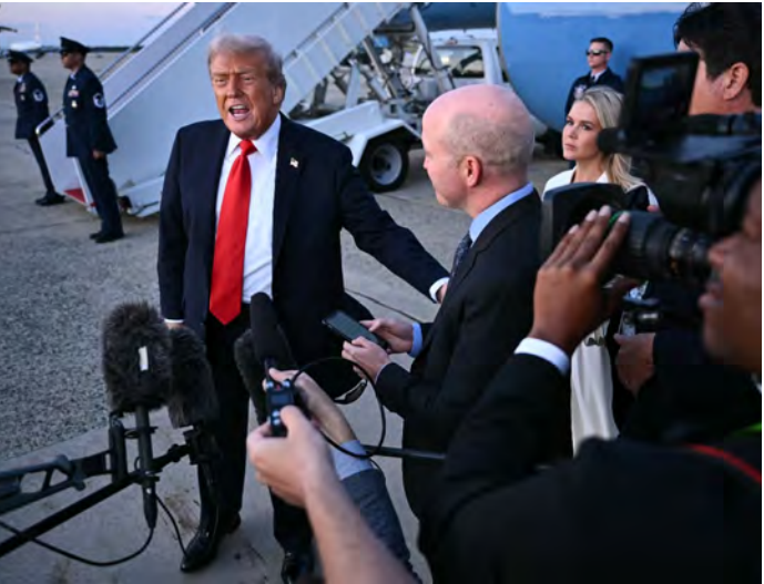
US President Donald Trump speaks to reporters (file photo)

President Donald Trump on Friday bashed US media coverage that he claimed was unduly negative and therefore "illegal," stoking a debate over free speech following the suspension of comedian Jimmy Kimmel's TV show by ABC. "They'll take a great story and they'll make it bad. See I think it's really illegal, personally," Trump, who has sued multiple major news organizations this year, told reporters gathered in the Oval Office. The 79-year-old Republican, an avid television watcher, chiefly focused his diatribe on US television networks, reiterating a claim that coverage of him and his administration is "97 percent bad." He also defended the head of the Federal Communications Commission (FCC), Brendan Carr, whose threats against broadcasters have sparked a national debate over free speech and caused some unease even among Republicans. Carr on Wednesday criticized Kimmel's remarks on the assassination of conservative activist Charlie Kirk and threatened broadcasters who carry his show with possible sanctions.