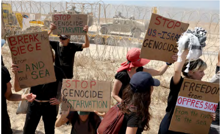
Left-wing Israeli activists demonstrate along the border with the Gaza Strip calling for an end to the war AFP | London

Hammas' armed wing published yesterday "farewell" photographs of most of the remaining hostages in Gaza, warning that Israel's assault on Gaza City could endanger them. With the images, it evoked the case of an Israeli pilot missing since 1986 after being shot down over Lebanon. Of the 251 people seized by Palestinian armed men during their attack on Israel in October 2023, 47 remain in Gaza, including 25 the Israeli military says are dead. "Due to (Prime Minister Benjamin) Netanyahu's obstinacy and (military chief Eyal) Zamir's submission.... a farewell photograph taken at the start of the operation in Gaza" City,