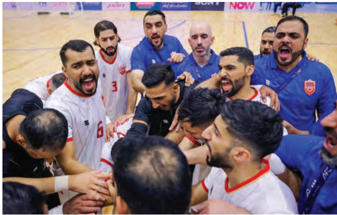
Bahrain's team huddle before kickoff

Bahrain held firm during the first half, but the breakthrough came for South Korea just four minutes after the restart. Kang Joo-kwang latched onto a second-ball chance to put the Koreans ahead. Despite Bahrain's attempts to fight back, their opponents doubled the lead in the 38th minute through Shin Jong-hoon, capitalising on a late power-play push by the Bahrainis.