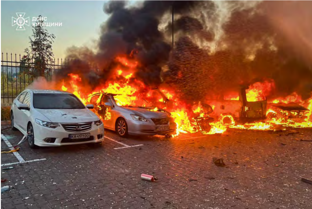
Burning cars are seen in a parking lot following an air attack in the Kyiv region

Ukrainian President Volodymyr Zelensky said yesterday he would meet US counterpart Donald Trump on the sidelines of the UN General Assembly next week as Russia intensified deadly strikes across his country. Russia carried out one of its largest aerial attacks, firing 40 missiles and some 580 drones at Ukraine in a nighttime barrage that killed at least three people and wounded dozens, Zelensky said. A Ukrainian strike killed four people in Russia's southwestern Samara region, the local governor said, in one of the deadliest Ukrainian strikes since Russia launched its invasion in 2022. Zelensky said he would discuss security guarantees for Ukraine and sanctions on Russia during the talks with Trump in New York. Ukraine has insisted on Western-backed security guarantees