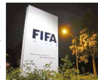
FIFA logo is seen at the entrance of it's headquarters

sus within the game that the ning of September, discusinternational match calendar sions are being organised in should be reformed and im- the coming weeks.