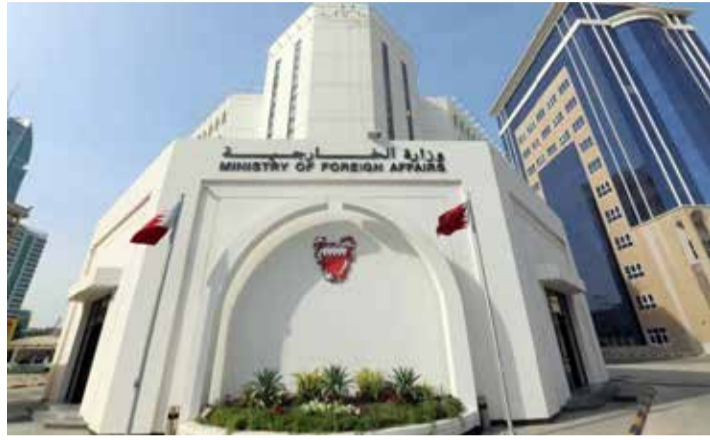
Foreign Affairs Ministry

The ministry highlighted in a statement the UAE record of human rights protection and adherence to the values of equality, justice and non-discrimination, in addition to its classification among the countries of "very