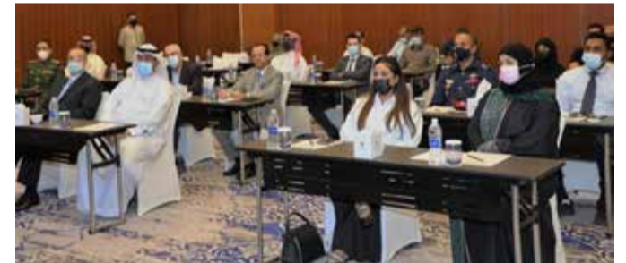
The discussion in progress TDT | Manama

Bahrain is keen to exert all efforts and back the international community to protect the environment from the severe damage caused by the depletion of the ozone layer due to chemicals and refrigerants.