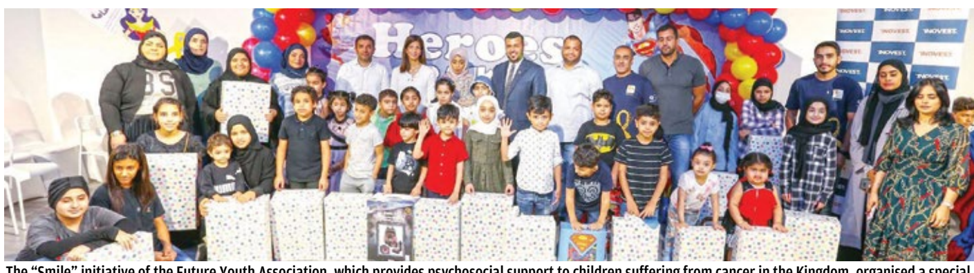
The "Smile" initiative of the Future Youth Association, which provides psychosocial support to children suffering from cancer in the Kingdom, organised a special celebration on the occasion of returning to schools with the great participation of the heroes' kids, their parents and relatives. The event was organised with the support of INOVEST. This celebration is part of the activities of the sixth edition of its awareness campaign "Our Children as Gold", in order to spread awareness of childhood cancer among various segments of society.