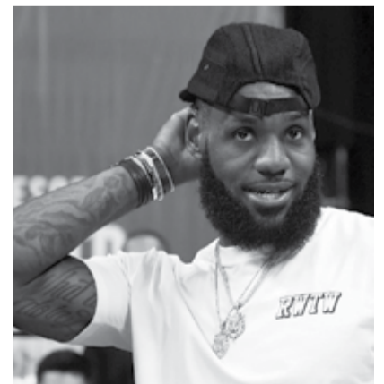
Basketball superstar LeBron James

"I loved his vision" for "Black Panther," James said of Coogler to The Hollywood Reporter.