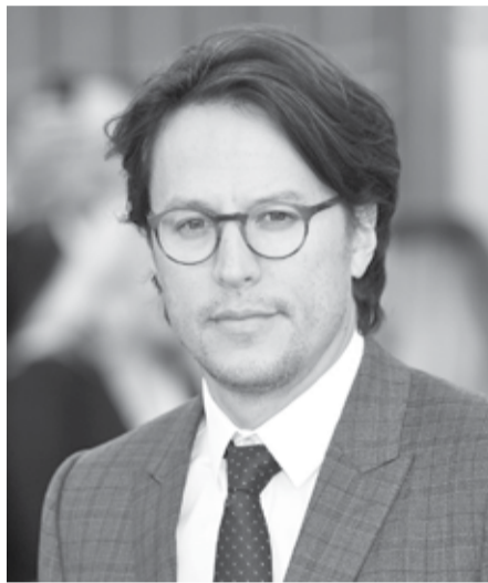
US filmmaker Cary Joji Fukunaga

Fukunaga replaces Oscar-winning British director Danny Boyle,