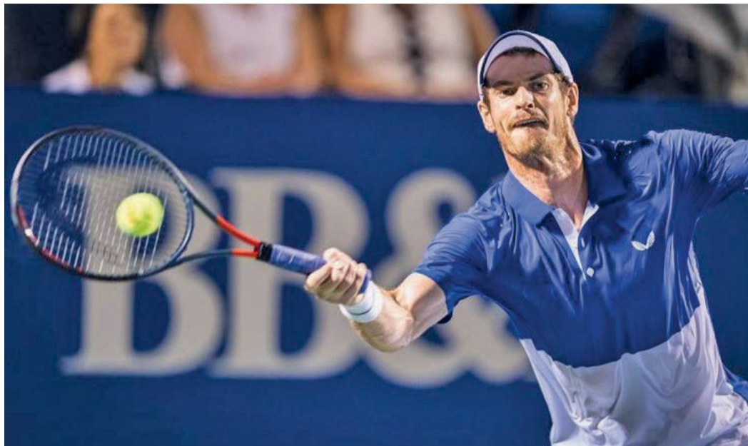
Andy Murray, of Great Britain, returns to Tennys Sandgren, of the United States

"So there's some good things in there but also some stuff I would like to do better."