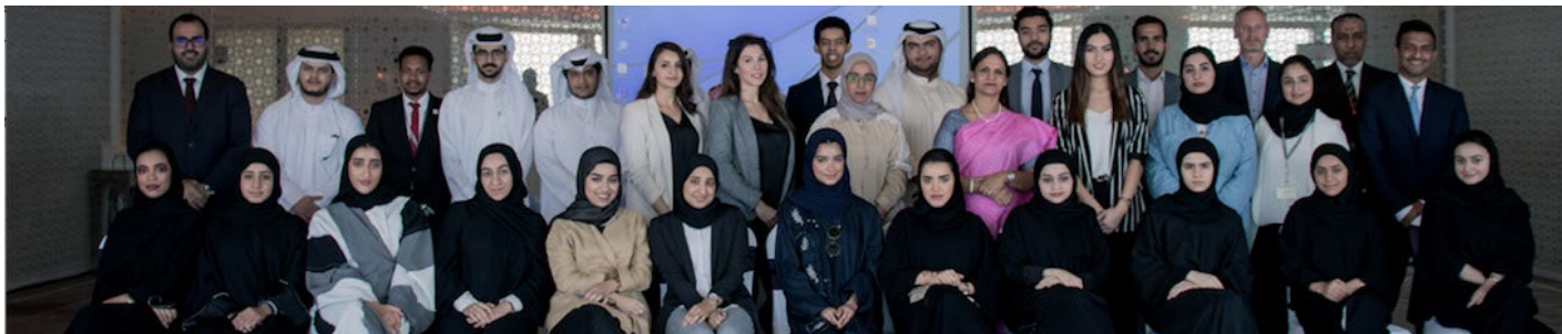
Participants and organisers of the workshop during a photocall