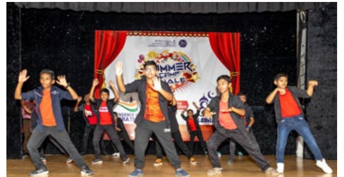
Participants during a dance performance