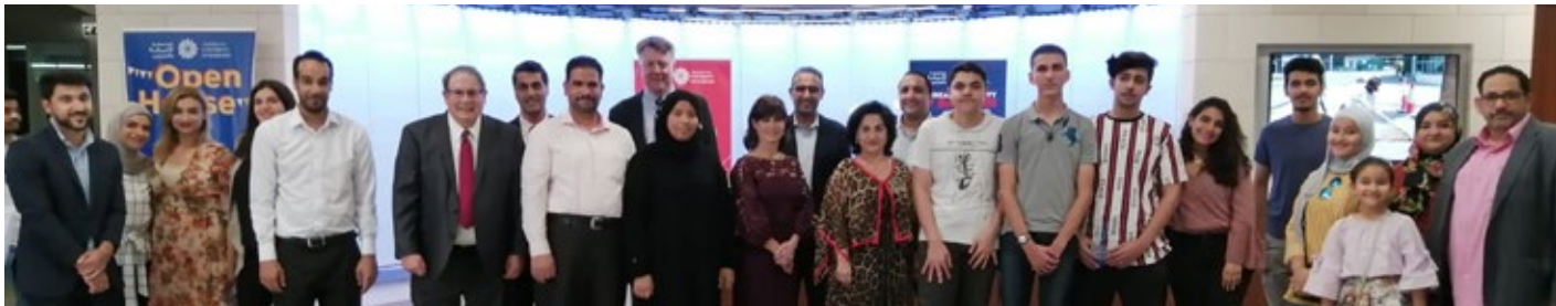
Visitors during AUBH open house