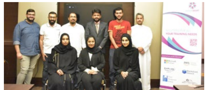
Graduates of the course during a photocall