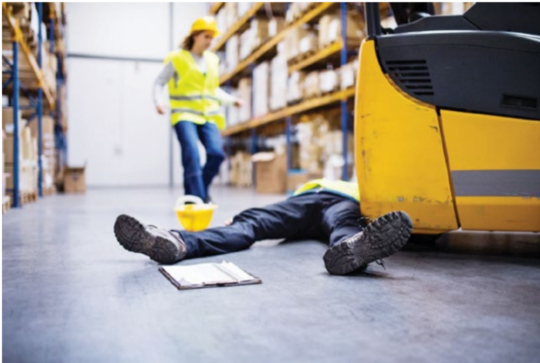
The Labour Ministry has been putting in best efforts to reduce worksite accidents.

The report, which compiled data from both private and public sectors showed that a total of 583 cases of worksite injuries