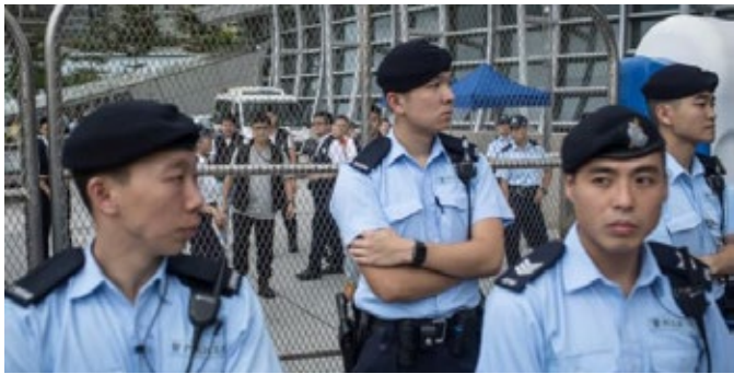
Police said they swooped on an industrial building in the district of Tsuen Wan on Friday evening and arrested a 27-year-old man