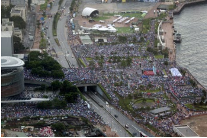
People attend a pro-government rally outside the government headquarters in Hong Kong