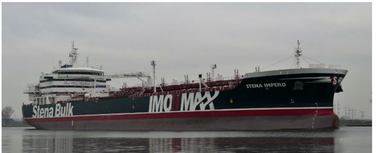
Stena Impero, a British-registered tanker, off the coast of Amsterdam. The British-registered tanker Stena Impero seized by Iran is now at anchor off the port of Bandar Abbas with all its crew aboard after colliding with a fishing boat, authorities said