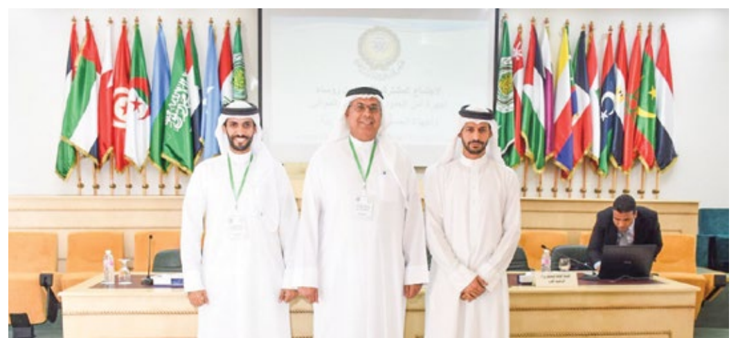
A security delegation chaired by the Director-General of King Fahad Causeway Police attended the third joint meeting of the heads of borders, airports, ports and customs authorities in the Arab world held at the Arab Interior Ministers Council headquarters in Tunisia. The meeting discussed the implementation of the recommendations of the previous meeting and co-ordination in information technology, along with prosperous experiences.