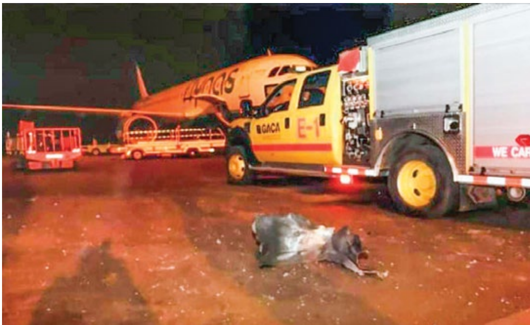
Debris seen on the tarmac following Houthi attack on Abha airport.

● The coalition had said earlier it also downed two drones in Yemeni airspace that had been launched towards Jizan.