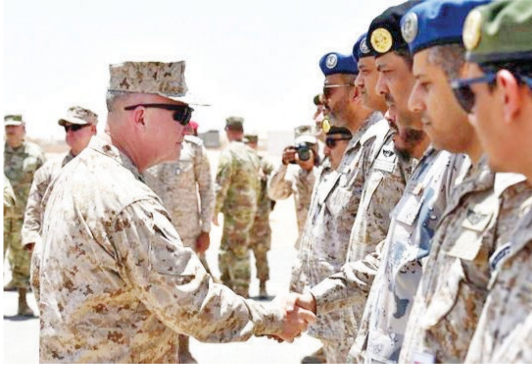
Gen Kenneth McKenzie, Commander of US Central Command, shakes hand with Saudi soldiers during his recent visit to the Kingdom.

Saudi Arabia's King Salman approved hosting US forces in the Kingdom to boost regional security and stability, the Saudi Ministry of Foreign Affairs said yesterday. The ministry tweeted that Saudi Arabia and the United States are "strengthening their longstanding partnership in the face of regional threats." In Washington, the US Defence Department confirmed the move in a statement, saying it would deploy troops and resources to Saudi Arabia to "provide an additional deterrent" in the face of "emergent, credible threats." The gesture comes amid rising tensions between Washington and Tehran in the Gulf