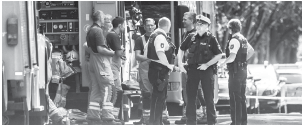
Policemen stand near a public service bus in Kuecknitz near Luebeck northern Germany