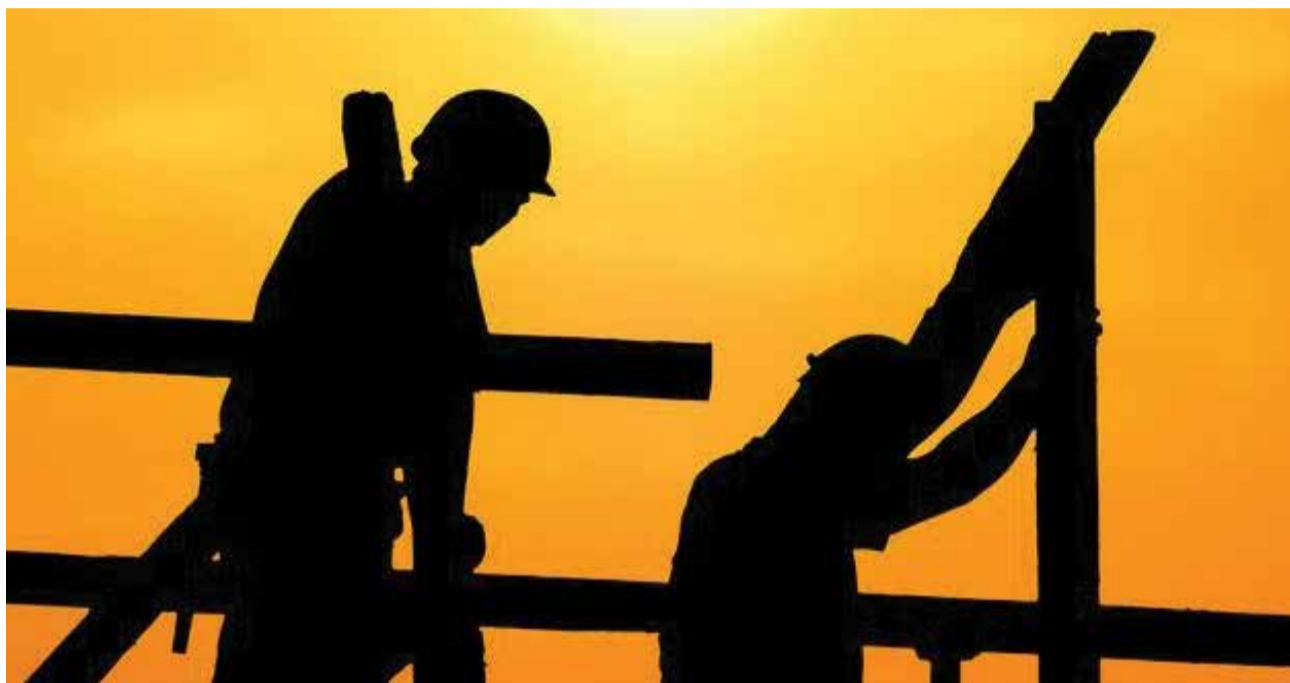
Workers say they are often made to work over 15 hours a day.

The labourer said most often company officials don't give proper response to their pleas.