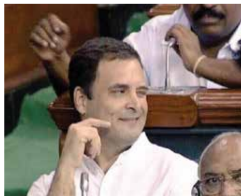
Rahul winks after hugging Modi.

After a speech accusing Modi of promoting crony capitalism, Gandhi addressed such criticism: "You have anger