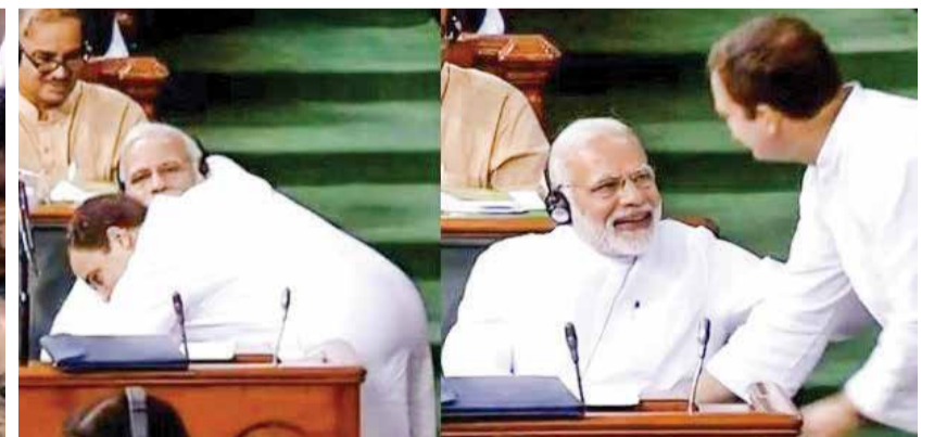
Rahul hugs Modi in Lok Sabha.

against me, you can call me names, you can abuse me, but I don't have a speck of hatred against you. I will take out this hatred out of you and turn it into love," he said before striding across the floor to put his arms awkwardly around the seated prime minister.