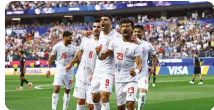
Iranian players celebrate after a spirited comeback in their opening match

extended Belgium's winless run at the World Cup to three matches, a stark contrast to the side that won 11 of its previous 13 games in the competition. Despite their status as one of Europe's leading nations, they suffered a group-stage exit at Qatar 2022 before falling in the last 16 at Euro 2024.