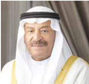
H.E. Ali bin Saleh Al Saleh, Speaker of the Shura Council

Shura Council Speaker Ali bin Saleh Al Saleh praised the Arab Inter-Parliamentary Union's efforts in strengthening joint Arab parliamentary work and enhancing its presence in regional and international forums.