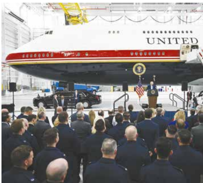
US President Donald Trump speaks in front of the new Air Force One, gifted to him by Qatar, in a hangar at Joint Base Andrews in Maryland

A framed print of a duck swimming in the Reflecting Pool -- a Washington landmark that Trump has sought to beautify with mixed results -- is among patriotic-themed