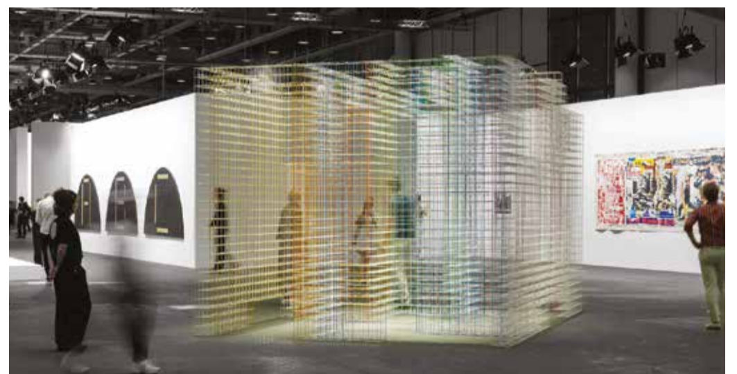
Crate Maze - White

Bahraini Artist Unveils Monumental Installation at Art Basel Switzerland