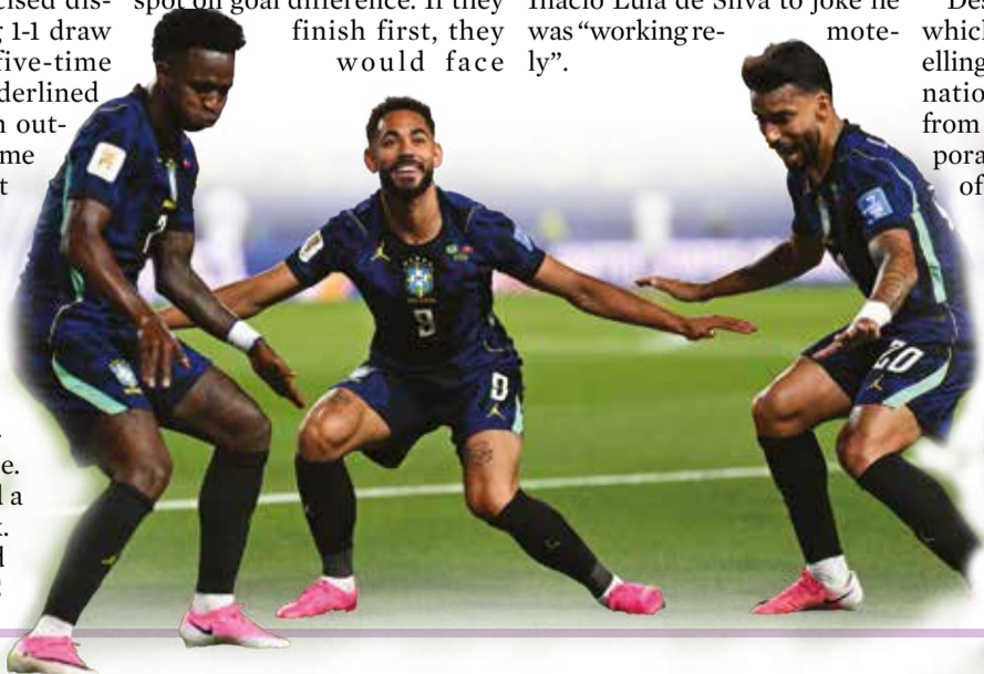
Brazil's forward #09 Matheus Cunha (C) celebrates with Brazil's forward #07 Vinicius Junior (L) and Brazil's midfielder #20 Lucas Paqueta after scoring his team's second goal

Haiti refused to go down without a fight as Alisson made two late saves to preserve Brazil's first clean sheet in seven outings, turning the page on an underwhelming start to the competition.