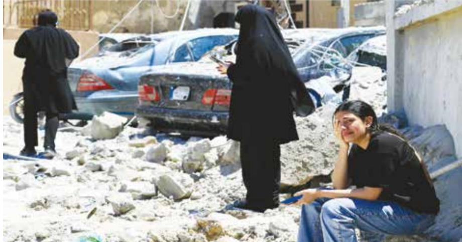
A Lebanese woman weeps as she sits on the rubble at the site of an Israeli airstrike that targeted the southern Lebanese village of Qennarit on June 20, 2026.

The US military said Saturday it remained "present and vigilant" in the Strait of Hormuz, shortly after Iran announced it was closing the critical shipping lane.