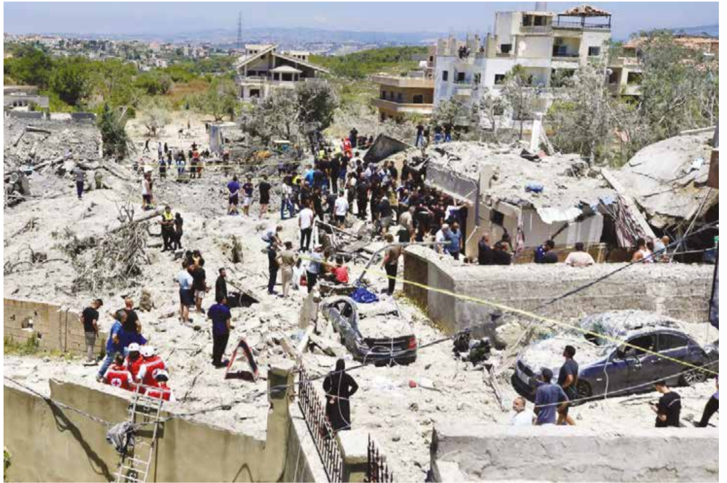
Civilians and first responders gather at the site of an Israeli airstrike that targeted the southern Lebanese village of Qennarit

The case is one of several corruption affairs that have embroiled the Socialist leader's family and former allies, putting pressure on his minority coalition government.