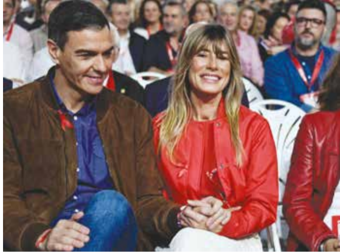
Spain's prime minister Pedro Sanchez (L) holds hands with his wife Begona Gomez