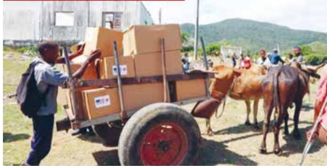
Residents affected by Hurricane Melissa on October 29, 2025 receiving humanitarian aid from Caritas volunteers, sent from the United States, in the rural community of Hongolosongo, a village in El Cobre, Santiago de Cuba municipality, eastern Cuba. Even as it maintains a crippling fuel blockade and slew of sanctions that pile misery on Cubans, Washington continues to send relief to Melissa victims through the Catholic NGO Caritas.