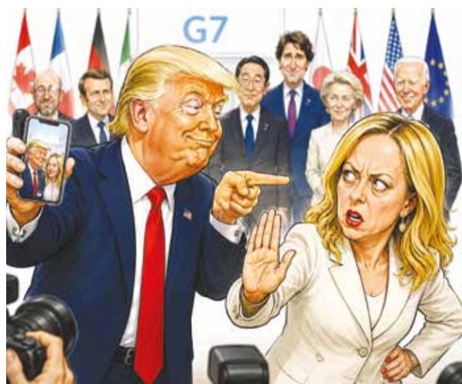
Trump had initially told Italian broadcaster La7 that Meloni "begged" him for a picture at this week's G7 summit in France, saying he agreed only because he "felt sorry for her."

He said Meloni was doing "poorly in Italy" and suggest-