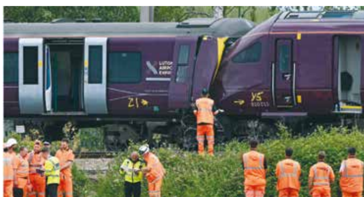
British Transport Police officers, Rail Accident Investigation Branch officers, and Network Rail work at the site

The crash Friday afternoon near Bedford, a town around 90 kilometres (55 miles) north of the British capital, involved two London-bound trains on the same track, according to East Midlands Railway (EMR), which operates both services.