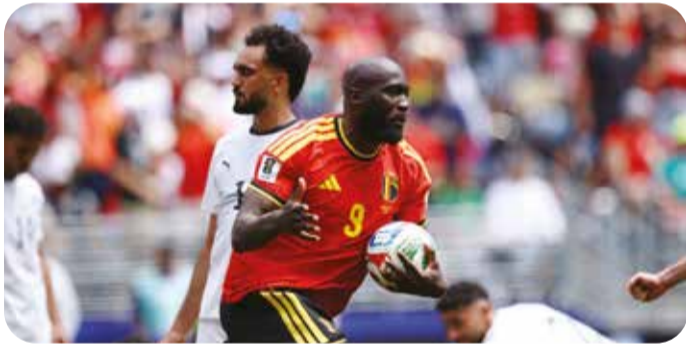
Lukaku carries the ball back to the centre circle after Belgium's equaliser in their Group G opener

Belgium continue their 2026 FIFA World Cup campaign tonight when they face Iran in Group G at the Los Angeles Stadium, with kick-off scheduled for 10pm Bahrain time.