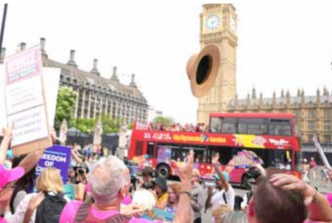
Campaigners for a change in the law on assisted dying celebrate outside The Palace of Westminster AFP | London

♦ The Philippine Navy seized an illegal drug shipment worth 10 billion pesos ($175 million) yesterday in one of the country's biggest narcotics hauls on record, officials said. A pair of naval gunboats intercepted a fishing vessel carrying 1.5 tonnes of methamphetamine hydrochloride off the coast of main island Luzon just before dawn, Commodore Edward de Sagon told a press conference. Four people, including one foreigner, were arrested in the joint operation with the Philippine Drug Enforcement Agency, according to de Sagon..