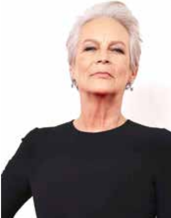
Jamie Lee Curtis

to be me, that I get to do what I do, that I get to do art and be a part of the art form that I get to be part of - entertainment. I love the combo platter of show business. I’m a marketing guru. I love marketing. And I just love the process of living a creating life. So I got no complaints.” Jamie previously described herself as a “loner”. Despite this, Jamie still enjoys spending time with her co-stars.