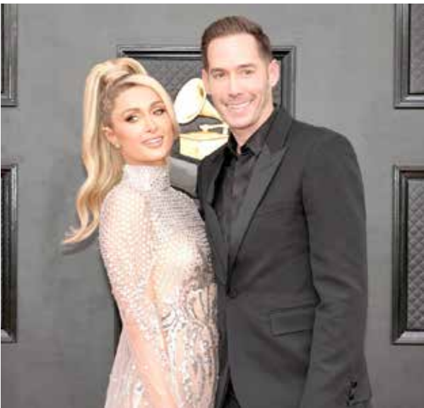
Paris Hilton and Carter Reum

every single day. [queen emoji] So happy and grateful for this beautiful life we are building together Love you so much Dada (sic)” Paris has also admitted that she loves the challenges of motherhood. She told E! News: “It’s been such a special time. “My little baby boy is my world and he’s made my life feel so complete. My husband is just the sweetest, kindest, most loyal and loving partner - just my everything. “It’s been amazing being a mom, being a wife and this new phase of my life. I just never felt so happy.”