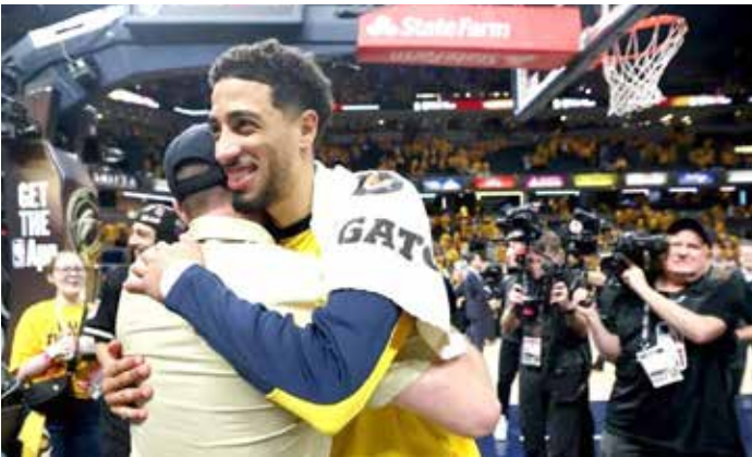
Tyrese Haliburton of the Indiana Pacers celebrates the Pacers' victory over the Oklahoma City Thunder

"We just wanted to protect home court," Haliburton said. "We didn't want to see these