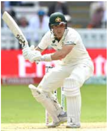
Marnus Labuschagne in action

Australia yesterday dropped Marnus Labuschagne for the opening match of their three-Test tour of the West Indies after a poor run of form while Steve Smith is out injured. Teenager Sam Konstas and Josh Inglis come into the starting XI for the opening match in Barbados starting on Wednesday. Labuschagne opened the batting in the World Test Championship final loss to South Africa last week but managed scores of