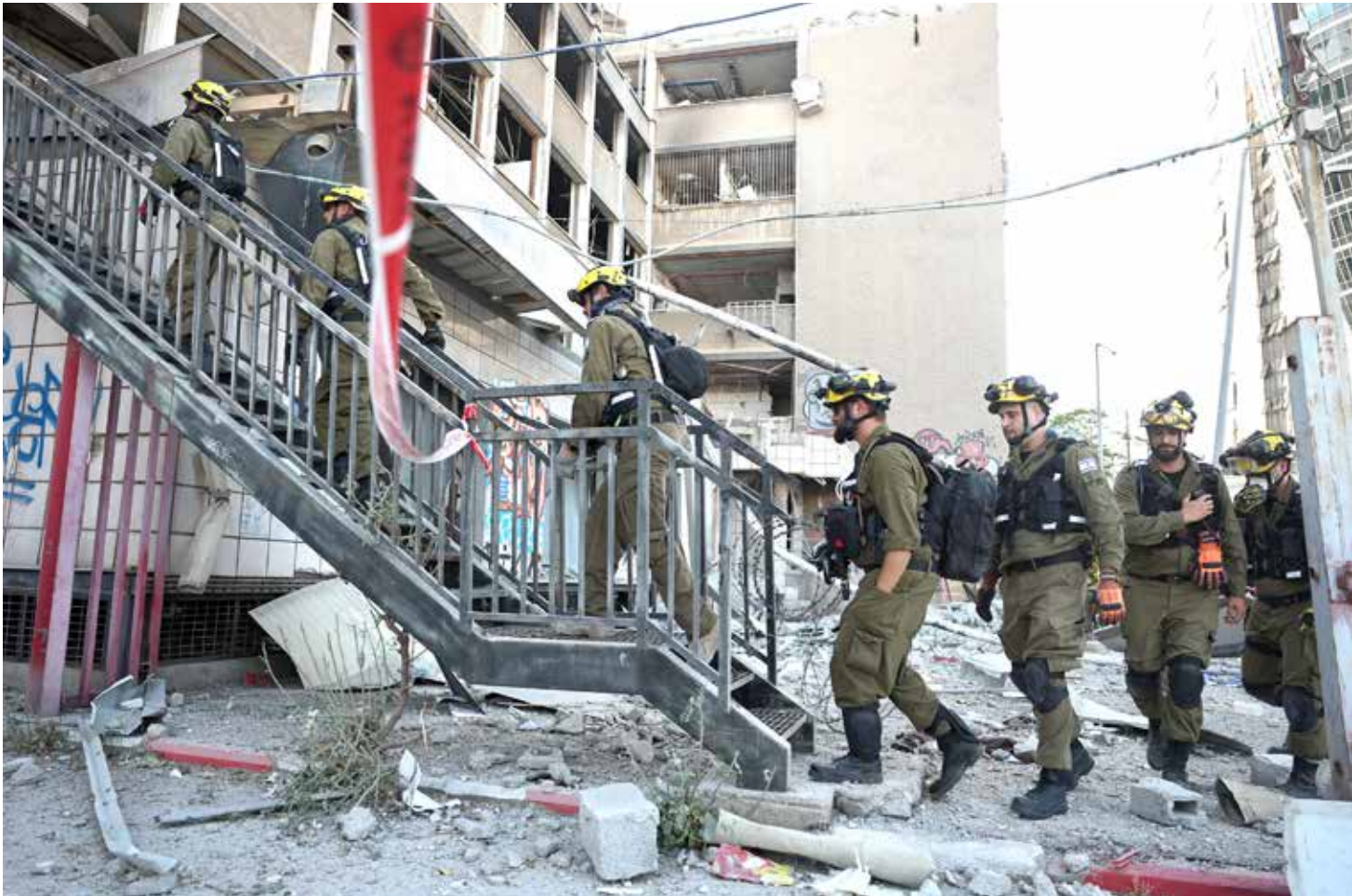
Israeli first responders enter a building that was hit by an Iranian strike in Haifa

At least one projectile appeared to evade Israel's air defences, slamming into an area by the docks of Haifa where it damaged a building and blew out windows, littering the near-