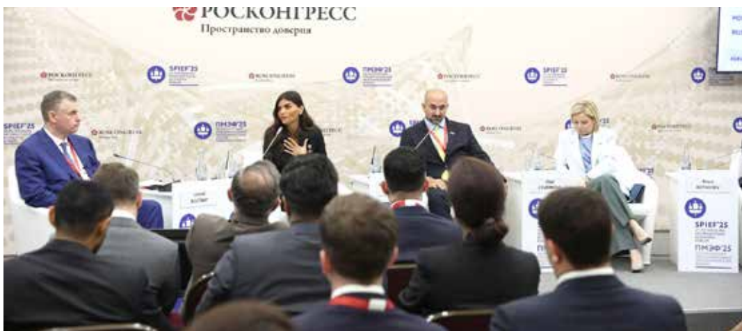
A session during the 28th St. Petersburg International Economic Forum

Speaking at the 28th St. Petersburg International Economic Forum (SPIEF), Buhejji highlighted Bahrain's approach to tourism as one that blends national identity with global com-