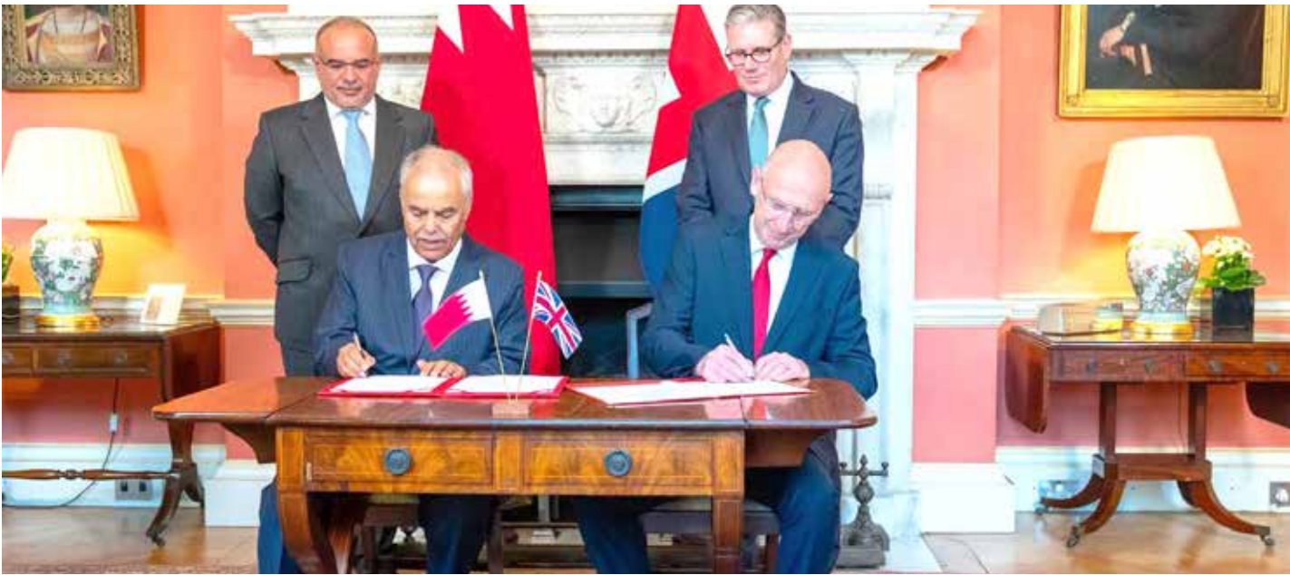
The deal signing

A day after the landmark Bahrain-UK defense agreement was signed, key strategic details are now emerging, outlining plans for deeper military coordination, stronger maritime security, and the United Kingdom's significant move into the Bahrain-US-led Comprehensive Security and Prosperity Agreement. The agreement, formalized during the official UK visit of His Royal Highness Prince Salman bin Hamad Al Khalifa, Crown Prince Deputy, Supreme Commander and Prime Minister, signals a further strengthening of the Kingdom's longstanding strategic relationship with Britain. It specifically highlights critical areas of future cooperation and mutual benefit.