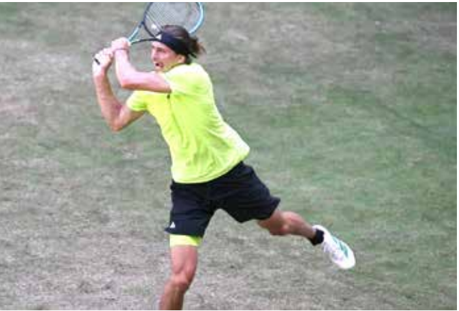
Alexander Zverev in action