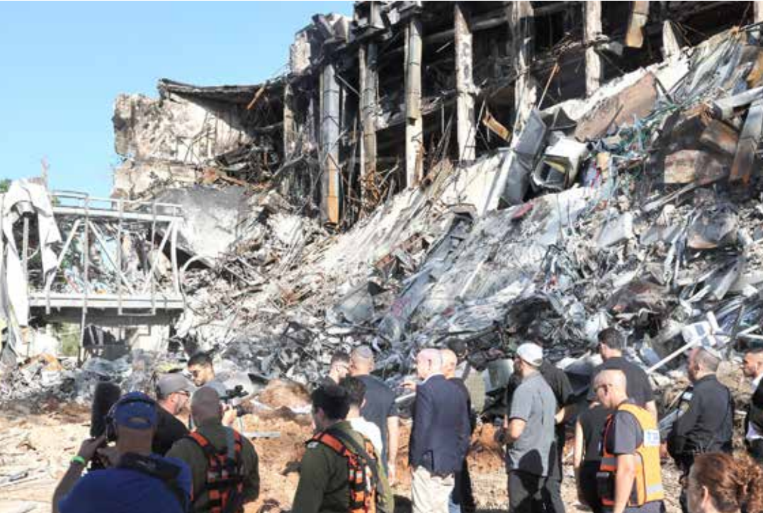
Israel's Prime Minister Benjamin Netanyahu visits the site of the Weizmann Institute of Science, which was hit by an Iranian missile barrage, in the central city of Rehovot

The United States issued new Iran-related sanctions yesterday, taking aim at the procurement of machinery for the country's defense industry at a time when war is flaring in the Middle East. The US Treasury Department said it was targeting an individual and eight entities over their roles in the sourcing and transshipment of "sensitive machinery for Iran's defence industry." "The United States remains resolved to disrupt any effort by Iran to procure the sensitive, dual-use technology, components, and machinery that underpin the regime's ballistic missile, unmanned aerial vehicle, and asymmetric weapons programs," said Treasury Secretary Scott Bessent in a statement. He added that Treasury would continue to target Iran's ability to make and proliferate such weapons, "which threaten regional stability and global security." The action comes as conflict is heating up in the Middle East. Iran has been firing daily missile salvos at Israel for the past week, since a wide-ranging Israeli at-