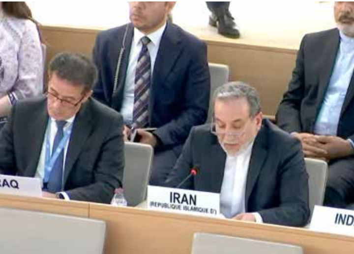
Iran's Foreign Minister Abbas Araghchi addressing the 59th session of the UN Human Rights Council in Geneva

Iran's foreign minister yesterday condemned the Israeli attacks against the Islamic republic as a "betrayal" of diplomatic efforts with the US, saying Tehran and Washington had been due to craft a "promising agreement" on the Iranian nuclear programme. "We were attacked in the midst of an ongoing diplomatic process," Foreign Minister Abbas Araghchi told the UN Human Rights Council in Geneva ahead of a crunch meeting with European foreign ministers. Araghchi, making his first trip abroad since the strikes began, denounced Israel's attack as an "outrageous act of aggression." US Special Envoy Steve Witkoff had planned to meet Araghchi in Oman on June 15 but the meeting was cancelled after Israel began the strikes days before. "We were supposed to meet with the Americans on 15 June