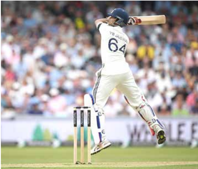
Yashasvi Jaiswal plays a shot

India's Yashasvi Jaiswal marked his first Test innings in England with a superb century and captain Shubman Gill hit an unbeaten fifty as the tourists took control of the series opener at Headingley yesterday. India dominated the bulk of the morning's play after being sent into bat, only to lose two wickets in quick succession as they ended the session on 92-2. By tea on the first day of the opening Test in a five-match series, India were firmly back in control on 215-2, with 23-year-old opener Jaiswal 100 not out. Gill, in his first innings as skipper since succeeding the retired Rohit Sharma, was also in fine form on 58 not out. The pair had so far shared an unbroken partnership of 123 in 25.2 overs, with India going through the second session