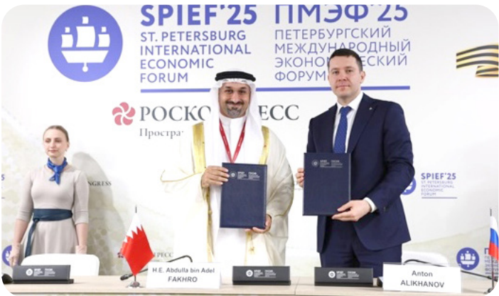
Signing of memorandums of understanding (MoUs) to cooperate in fuel and energy sector technologies and equipment.

His Highness Shaikh Nasser bin Hamad Al Khalifa, Representative of His Majesty the King for Humanitarian Work and Youth Affairs, met with Vladimir Putin, President of Russia, on the sidelines of the Saint Petersburg International Economic Forum (SPIEF) 2025. His Highness Shaikh Nasser conveyed the greetings of His Majesty King Hamad bin Isa Al Khalifa and His Royal Highness Prince Salman bin Hamad Al Khalifa, the Crown Prince and Prime Minister. HH Shaikh Nasser highlighted the strong and growing partnership between Bahrain and Russia, noting that bilateral cooperation continues to expand across strategic and cultural fields. HH Shaikh Nasser also praised Russia's efforts in hosting the forum, describing it as a