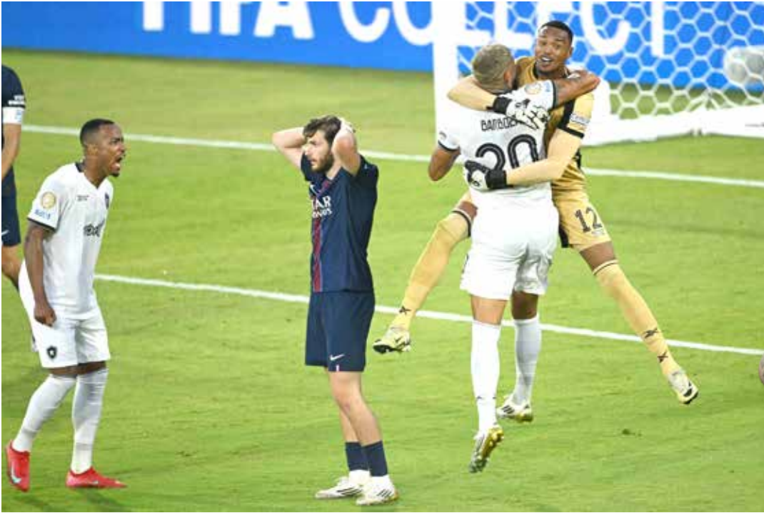
Botafogo's Brazilian goalkeeper #12 John and Argentine defender #20 Alexander Barboza celebrate next to Paris Saint-Germain's Georgian forward #07 Khvicha Kvaratskhelia and Botafogo's Brazilian midfielder #17 Marlon Freitas