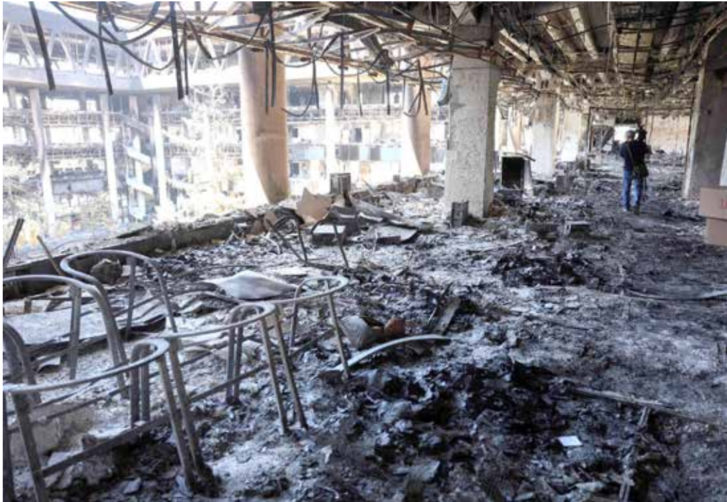
Heavily damaged building of the Islamic Republic of Iran Broadcasting (IRIB) after it was hit a few days earlier in an Israeli strike, in Tehran

The Iranian "operation was made possible thanks to the convergence of operational and