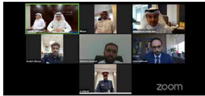
The remote discussion in progress

Al Shater added: "21% of the complaints were related to the