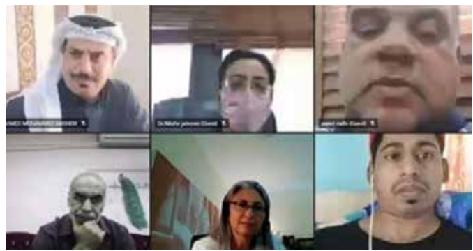
Participants in the online event