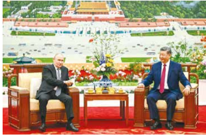
Russia's President Vladimir Putin and China's President Xi Jinping hold a tea chat in Beijing

an "unprecedentedly high level" despite "unfavourable external factors", Russian media footage showed.