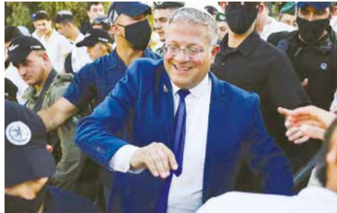
In the video shared by Mr Itamar Ben Gvir, he is seen encouraging staff at the detention centre as they push down an activist who had stood up to say "free free Palestine" as he walked by.