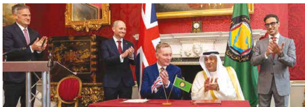
A landmark moment for Bahrain as the UK-GCC Free Trade Agreement is formally concluded, opening new doors for trade, investment and opportunity.

The United Kingdom and the Gulf Cooperation Council concluded negotiations on a