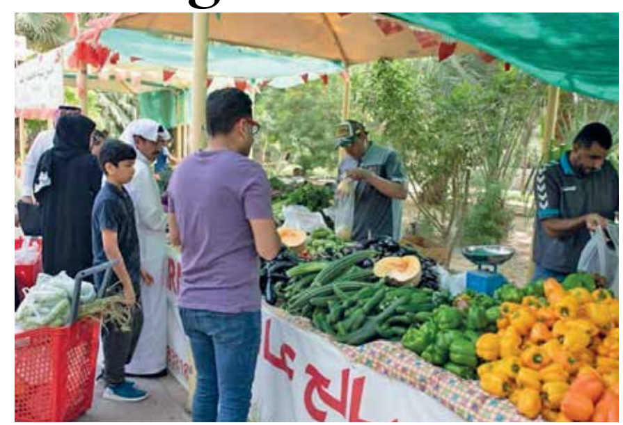
People buying vegetables from a shop