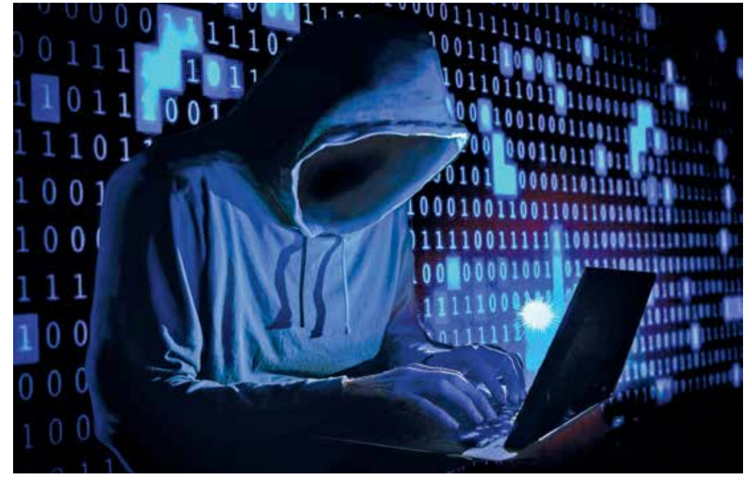
Representative picture.

Social media accounts pumping terrorist materials into the Kingdom were found to have their roots in Iran, Qatar, Iraq and some European Countries. Authorities are warning not to deal or interact with those accounts and networks to avoid accountability