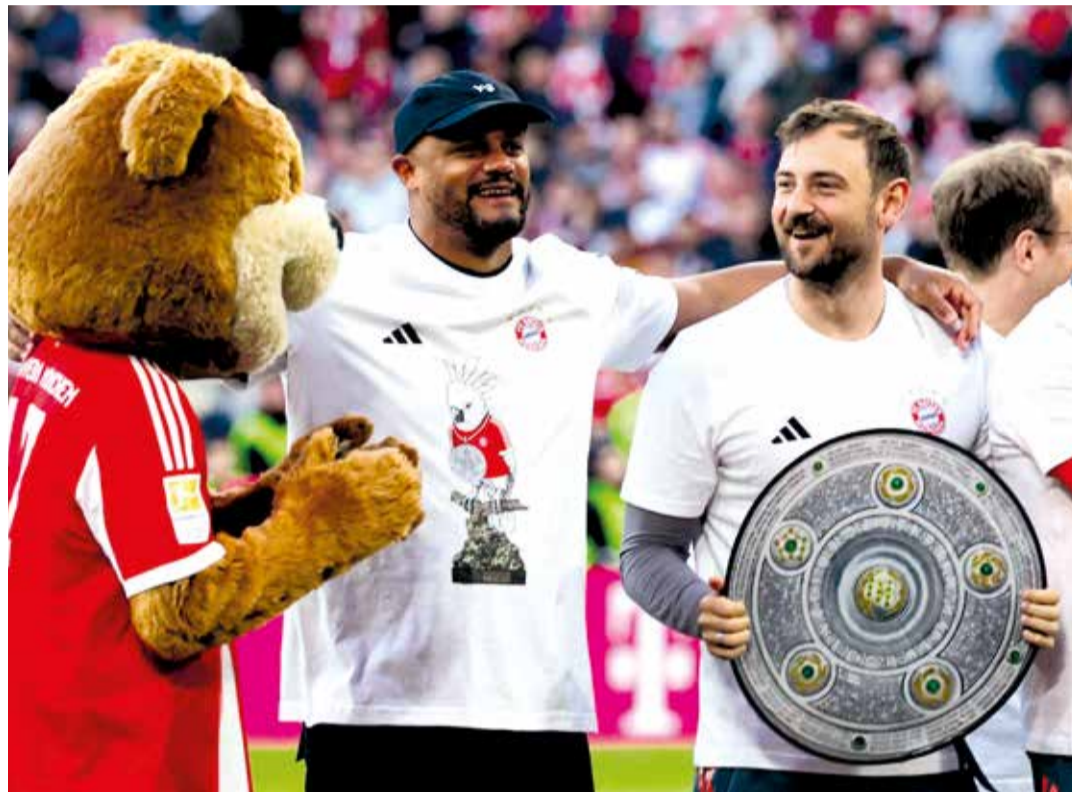
Bayern Munich's Belgian head coach Vincent Kompany celebrates after winning the match

"I think we're planning a proper celebration, probably at the last home game.