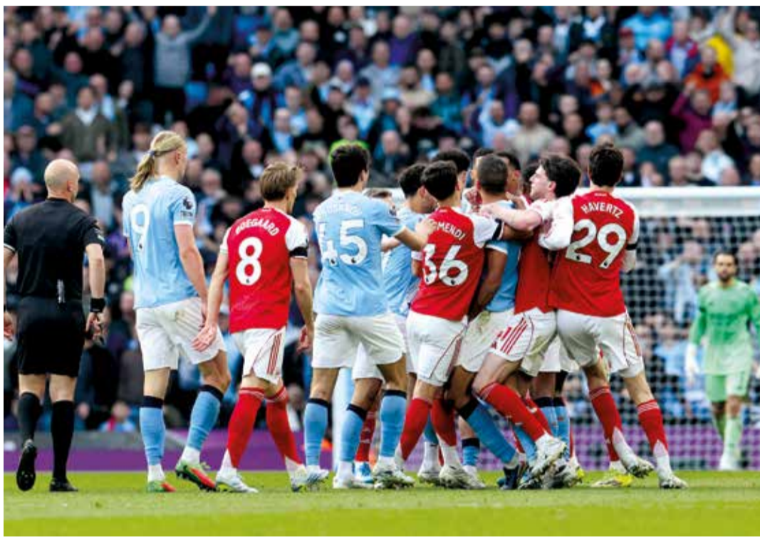
Players tussle after Manchester City's Norwegian striker #09 Erling Haaland and Arsenal's Brazilian defender #06 Gabriel Magalhaes went head to head

years have passed since Arsenal last won the Premier League title, with the Gunners now facing another season of frustration