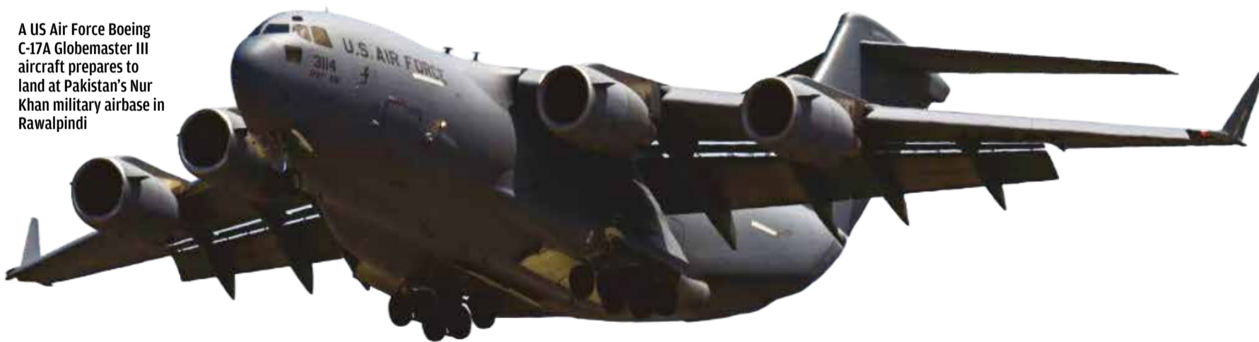
A US Air Force Boeing C-17A Globemaster III aircraft prepares to land at Pakistan's Nur Khan military airbase in Rawalpindi

The US president said his negotiators, whom he did not name, would arrive in Islamabad. A White House official said Vice President JD Vance would lead the delegation after Trump said he would not, citing security concerns. He would be joined by Middle East envoy Steve Witkoff and Trump's son-in-law Jared Kushner, the official said.