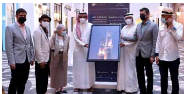
An art work on display at the venue

It was organised at the Dilmunia Complex in Muharraq Governorate coinciding with