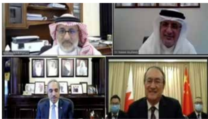
The online discussion in progress

● Minister Khalaf meets Chinese Ambassador