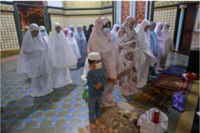
Muslim women perform an evening prayer at Al Mashun Great Mosque in Medan, North Sumatra, Indonesia

In Iraq, a curfew will remain in place from 7 pm to 5 am throughout Ramadan, with total lockdown on weekends. The Health Ministry warned that non-compliance with these measures could lead to three-