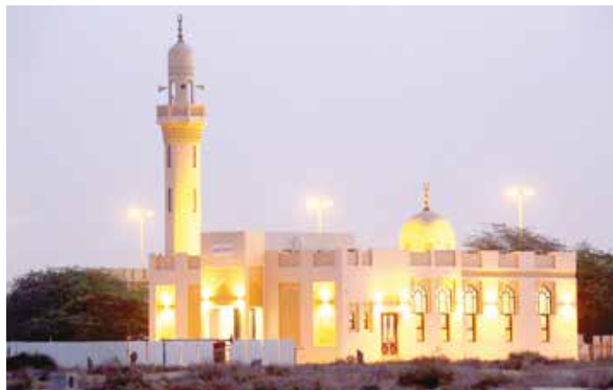
Mosques must put in place the required health measures for the safety of worshippers

The three mosques violated the established health precautionary measures, as those in charge of them allowed the en-