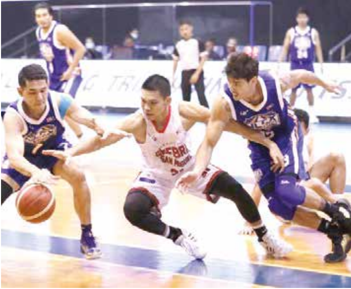
The opening of PBA’s 46th season is getting delayed due to the pandemic