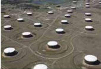
Crude oil storage tanks are seen from above at the Cushing oil hub, in Cushing, Oklahoma

on exports from the port of Hariga and said it could extend the measure to other facilities, citing a budget dispute. Hariga is scheduled to load about 180,000 barrels per day (bpd) in April. Brent crude was up 35 cents, or 0.5%, at $67.40 a barrel by 1335 GMT after hitting its highest since March 18 at $68.08.