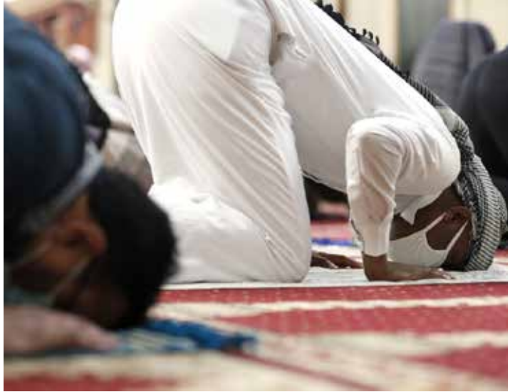
A man bows during an evening prayer at Chicago's Muslim Community Center

And in Egypt, the government prevented mosques from serving free meals during Ramadan and banned traditional charitable iftars that would bring together strangers at long tables.