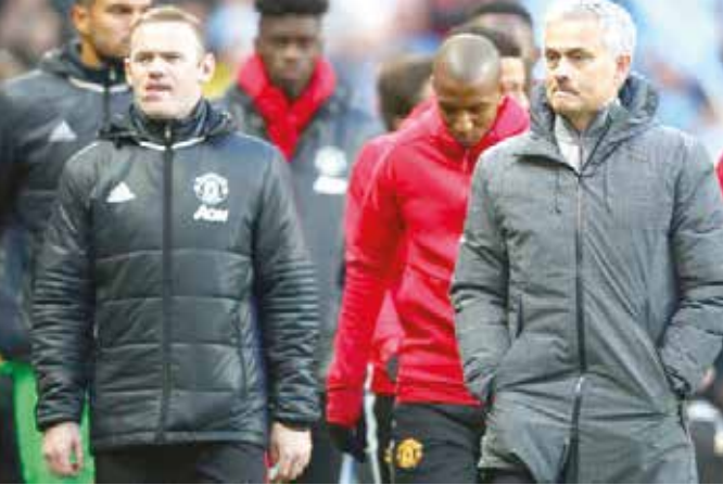
Jose Mourinho and Wayne Rooney make their way to the bench during a match (file photo)