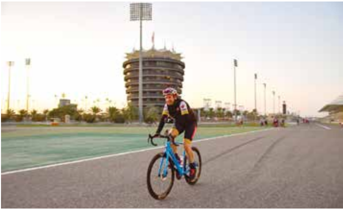
A man rides a bike at BIC

Bahrain International Circuit (BIC), “The Home of Motorsport in the Middle East”, announced yesterday the launch of Fitness on Track, an extensive programme of activity for cyclists and runners of all ages who are looking to maintain their physical fitness. The first series of events launches this Thursday with three weekly Ramadan Specials, sponsored by Batelco. The all-new Fitness on Track programme is dedicated to offering cyclists and runners the opportunity to train or simply