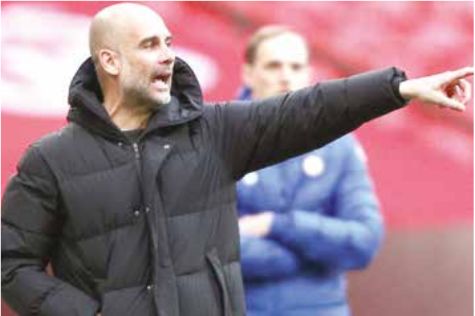
Manchester City’s Spanish manager Pep Guardiola gestures on the touchline during a match

Manchester City boss Pep Guardiola has criticised the closed format of a proposed breakaway European Super League, saying it is “not sport” if success is guaranteed. City are one of 12 clubs to have signed up to the proposal, alongside Manchester United, Liverpool, Chelsea, Arsenal, Tottenham, Real Madrid, Barcelona, Atletico Madrid, Juventus, Inter Milan and AC Milan. The Super League would guarantee a spot for up to 15 founding members every year, removing the uncertainty of