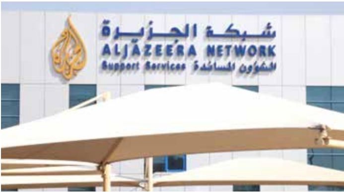
Al Jazeera channel ... politicising the situation

The Kingdom also has developed systems in the field of reform and rehabilitation, in addition to expanding the im-