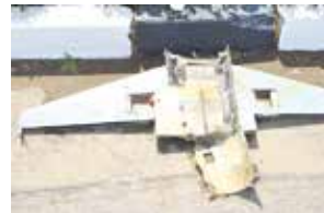
Destroyed Houthi drone Dubai

The Saudi-led Arab coalition intercepted and destroyed a Houthi drone targeting Saudi Arabia's Khamis Mushait yesterday, state TV Al-Ekhbariya reported.