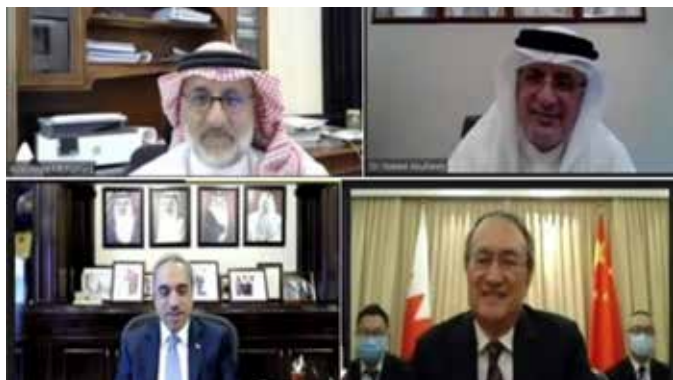
The online discussion in progress

● Minister Khalaf meets Chinese Ambassador