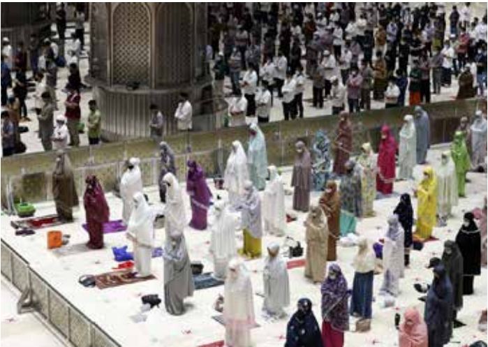
Indonesian Muslims pray spaced apart as they practice social distancing to curb the spread of the new coronavirus during an evening prayer

Only limited numbers of worshippers are being allowed inside the Grand Mosque that houses the Kaaba in an effort to prevent the spread of the virus. Saudi authorities are only allowing individuals who've been vaccinated or recently recovered from the virus to perform taraweeh prayers at the Kaaba.