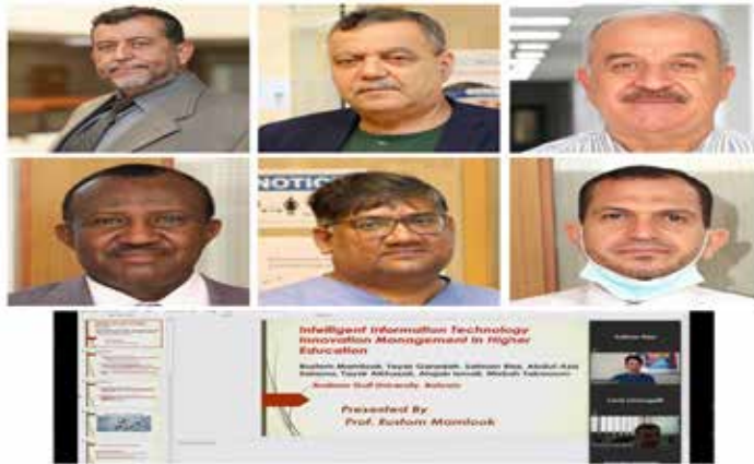
Participants discuss various topics remotely

Researchers from Arab countries, East Asia, Europe and the US participated in the conference as well as a number of graduate students who took part to enrich the dialogue and made recommendations for the application of new technologies in the