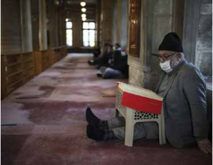
People pray at the Eyup Sultan Mosque, in Istanbul