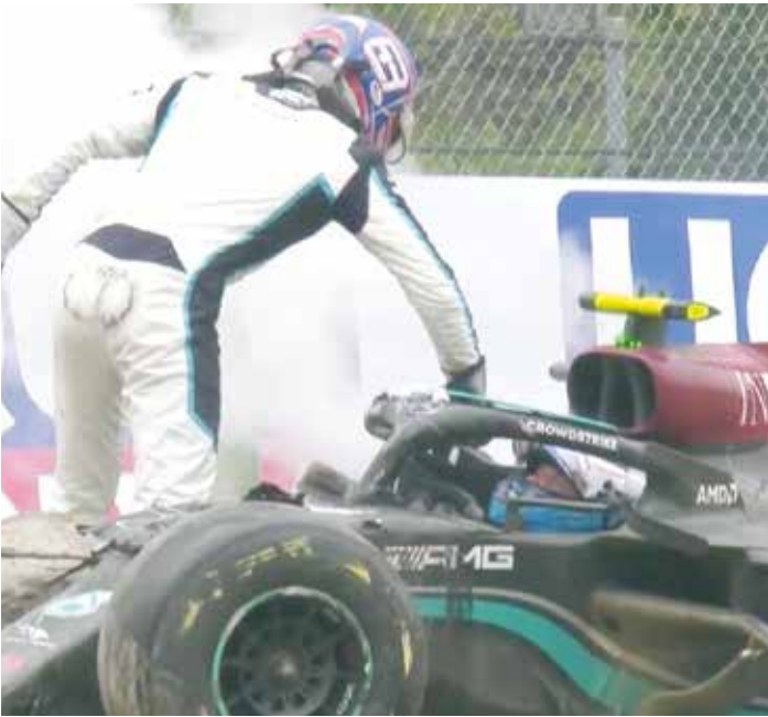
George Russell (standing) and Valtteri Bottas in the wake of the crash

George Russell apologised publicly to Formula One rival Valtteri Bottas on Monday for his behaviour after the pair collided at the Emilia Romagna Grand Prix. “Yesterday wasn’t my proudest day,” the 23-year-old Briton said on social media. The Williams driver had been trying to pass Bottas’ Mercedes for ninth place on Sunday when they made contact at speed and crashed out, bringing the race to a halt. Neither was hurt and stewards declared it a racing incident. Russell climbed out and confronted Bottas, still sitting in his wrecked car, and asked him whether he had wanted to kill them both. He also accused the Finn of breaking a ‘gentleman’s agree-