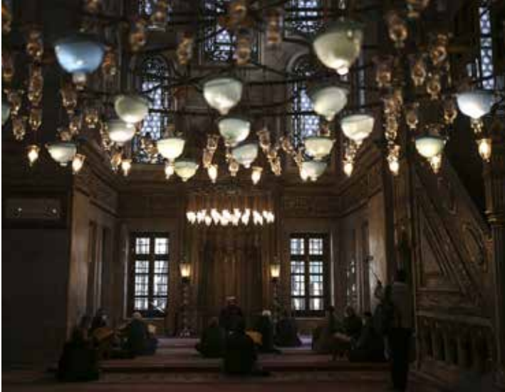
People pray at the Eyup Sultan Mosque, in Istanbul