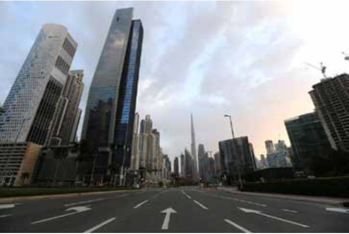
A general view of Business Bay area, after a curfew was imposed to prevent the spread of the coronavirus disease (COVID-19), in Dubai, United Arab Emirates

The United Arab Emirates central bank said yesterday it has extended until mid-2022 some stimulus measures introduced last year to mitigate the impact of the coronavirus crisis on the economy. The Targeted Economic Support Scheme (TESS) helps banks provide temporary relief to companies and individuals affected by the COVID-19 pandemic and facilitates additional lending capacity through the relief of existing capital and liquidity buffers. Banks will continue to be eligible to access a collateralised 50 billion dirham ($13.61 bn)