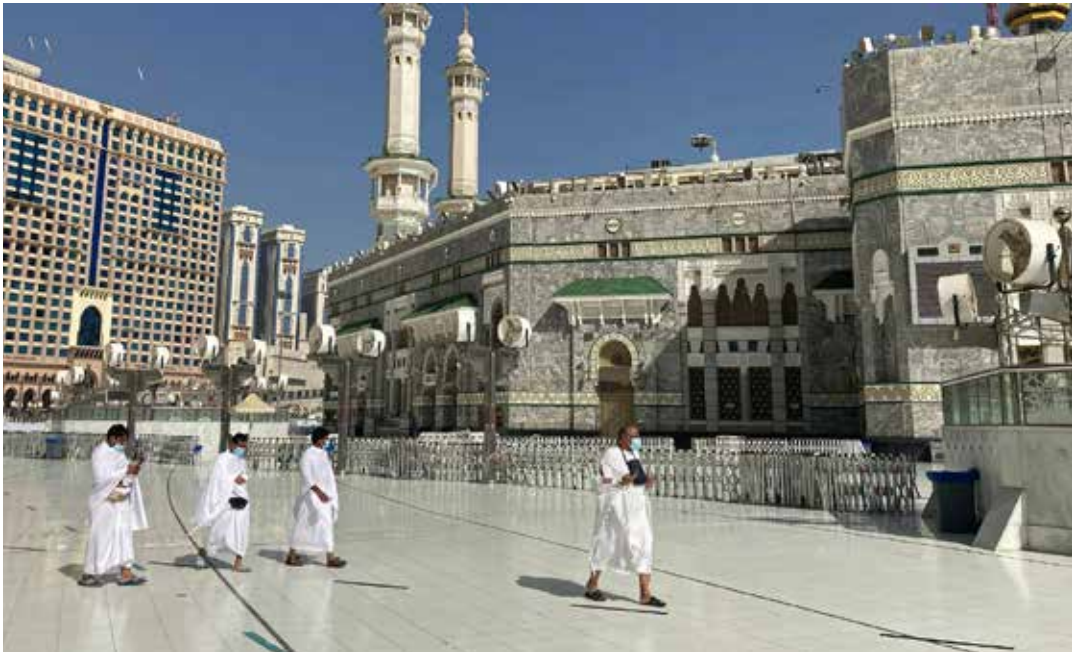
Muslim pilgrims walk outside the Grand Mosque, during the minor pilgrimage, known as Umrah, marking the holy month of Ramadan, in the Muslim holy city of Mecca

are also spiking. Mosques are being allowed to open for Ramadan prayers with strict protocols in place.