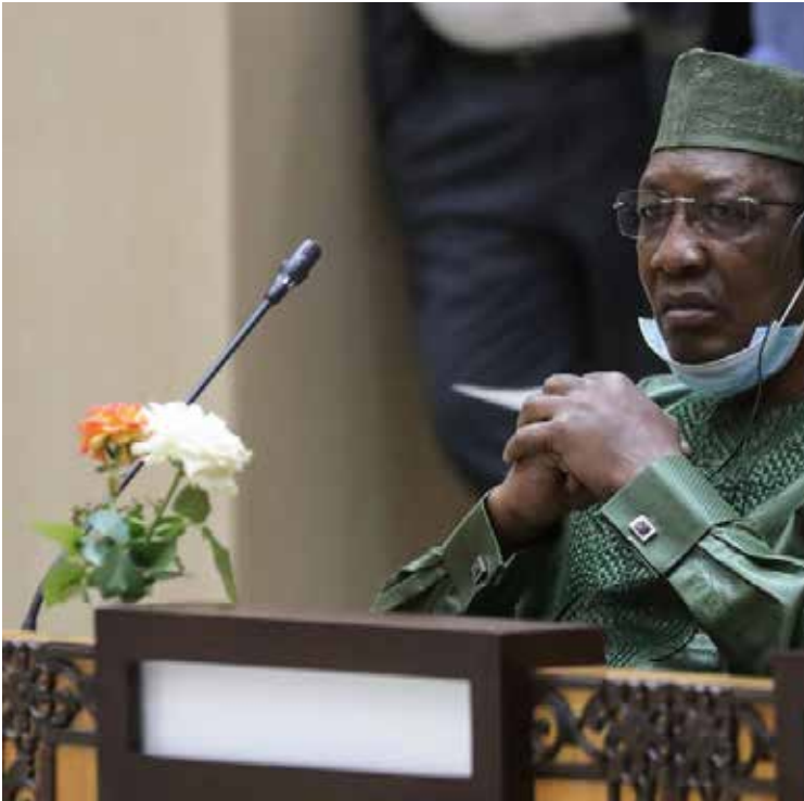
Chad's President Idriss Deby attends a working session of the G5 Sahel summit in Nouakchott, Mauritania, on Monday.

His death was announced the day after he was declared the winner of a presidential election that