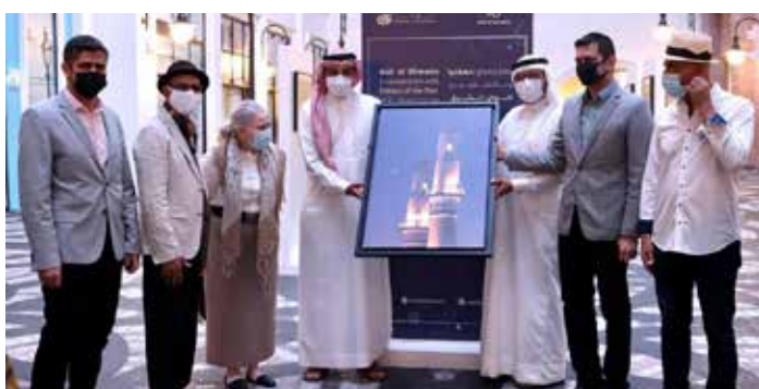
An art work on display at the venue the advent of the Holy Month of Ramadan.

It was organised at the Dilmunia Complex in Muharraq Governorate coinciding with