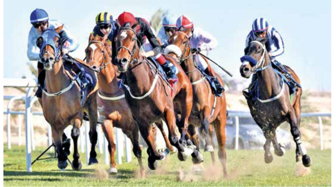
Plenty of exciting action is set for today at REHC (file photo)