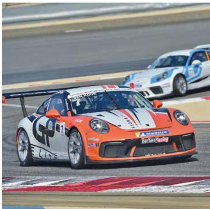
Cars in action at BIC (file photo)

He has 213 points and enjoys a comfortable lead over