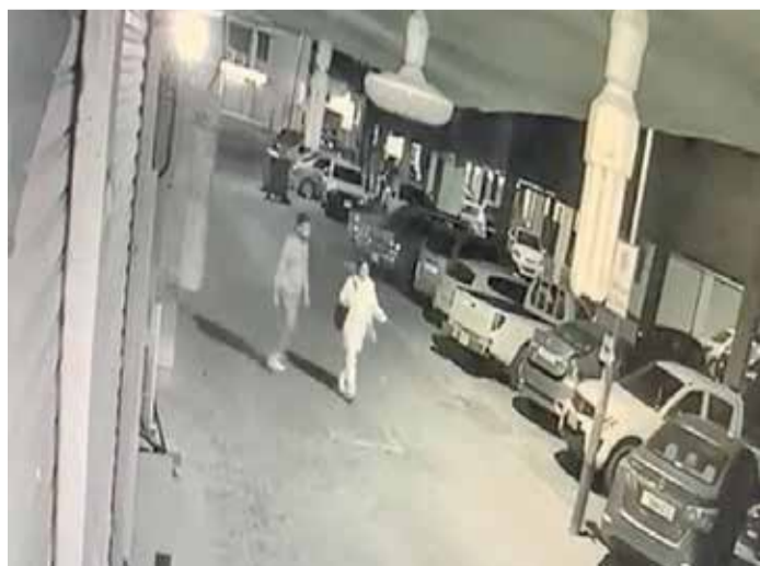
Screengrab from a footage showing the attacker and the victim

Interior ministry confirmed the arrest of the 29-year-old suspect through a combined action by the Capital Police Directorate and the General Directorate