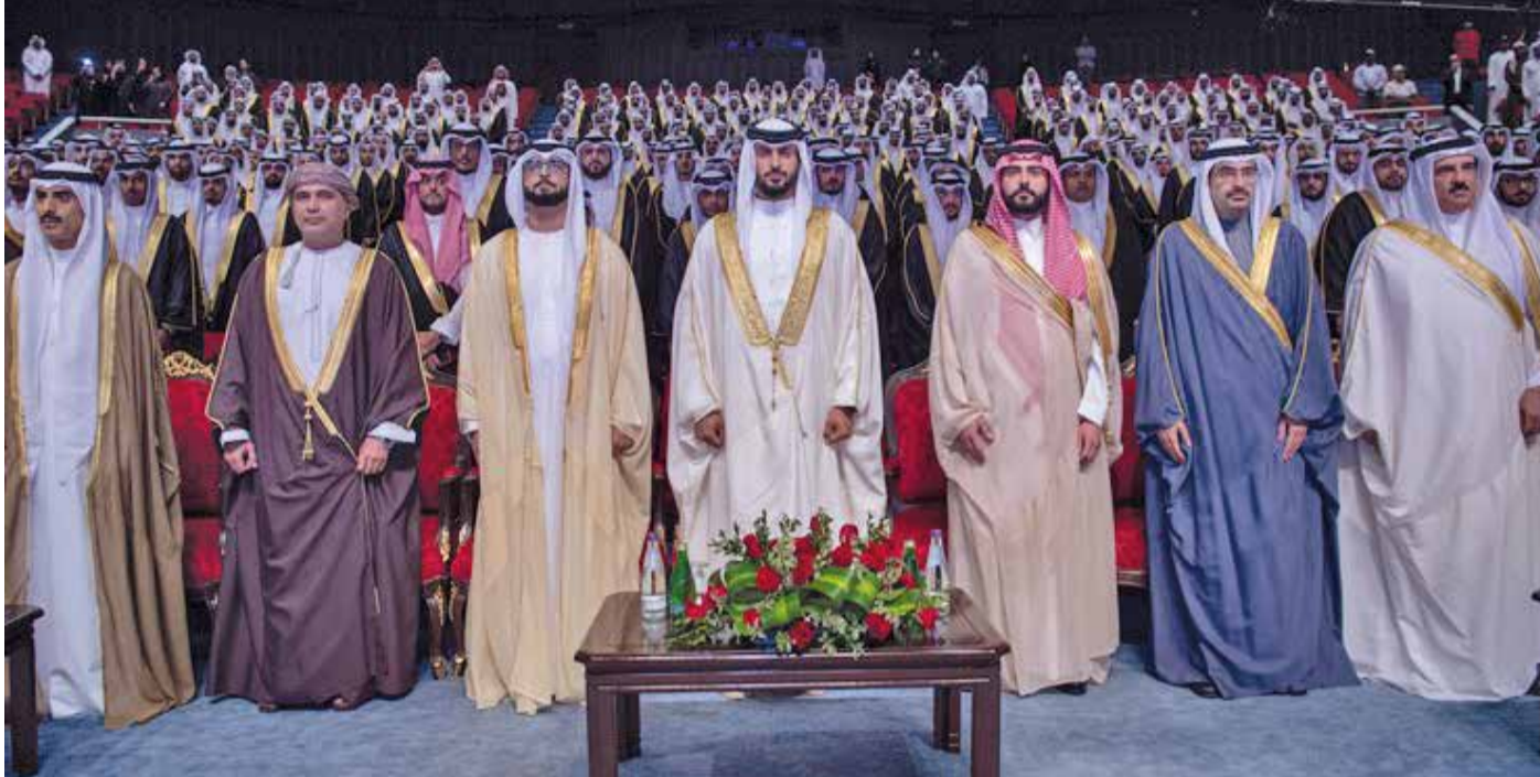
The ninth mass wedding was held in the presence of His Majesty the King's Representative for Charity Works and Royal Charity Organisation (RCO) Board of Trustees' Chairman His Highness Shaikh Nasser bin Hamad Al-Khalifa.