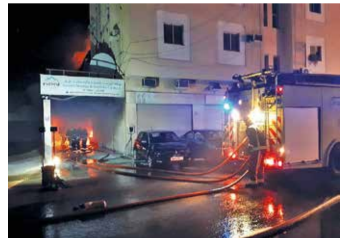
Fire brigades at the scene of fire