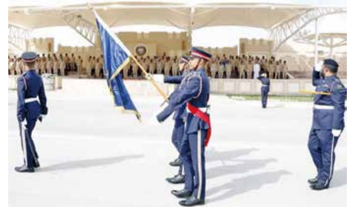
The Bahrain Defence Force (BDF) military units marked its 52nd anniversary with several events, functions and programmes