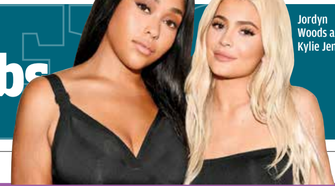
Jordyn Woods and Kylie Jenner

Since then, their relationship has gone through its ups and downs, but many sources have told E! News that Khloe's first priority is being a mother to True.