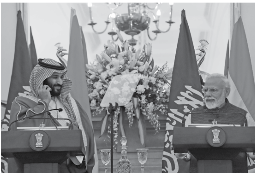
Indian Prime Minister Narendra Modi (R) speaks as Saudi Crown Prince Mohammed bin Salman looks on during a joint press briefing at Hyderabad House in New Delhi

"Today we expect the opportunities we are targeting in India in various fields to exceed $100 billion in the coming two years... we want to work with you, Mr