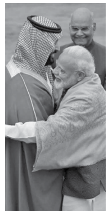
Crown Prince is greeted by Modi as President Ram Nath Kovind watches

Modi has sought to use India's fast-growing economy to attract more investment from Saudi Arabia and other Islamic nations since he took office.