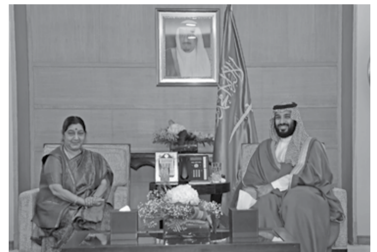
Saudi Crown Prince Mohammed bin Salman (R) during a meeting with Indian Minister of External Affairs Sushma Swaraj