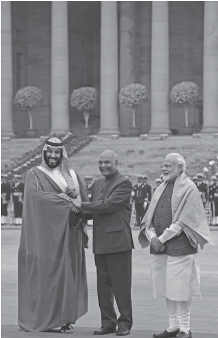
Indian President Ram Nath Kovind (C) shakes hands with Saudi Crown Prince Mohammed bin Salman (L) as Indian Prime Minister Narendra Modi looks on during ceremonial reception at Presidential palace in New Delhi

predicted "good things" will come out of talks with Indian leaders as he started a landmark visit to the world's largest democracy Wednesday.