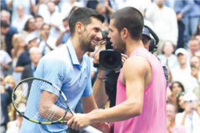
Spain’s Carlos Alcaraz and Serbia’s Novak Djokovic (L) hug at the net after a match (file photo)

Carlos Alcaraz’s new-look serve at the Australian Open has been compared to Novak Djokovic and the Serbian great says he is expecting a slice of the Spanish superstar’s winnings. World number one Alcaraz has at times struggled with precision and a lack of consistency in his serving technique and has mixed it up for the opening Grand Slam of the year. Eagled-eyed fans noticed that his more compact action now bears a striking resemblance to Djokovic, who was asked about it after coasting into the second round at Melbourne Park. “As soon as I saw it, I sent him a message. I said, ‘we have to speak about the copyrights,’” the 24-time major winner joked. “Then when I saw him here, I told him we have to talk about a percentage of his winnings. “Every ace I expect, you know, a tribute to me. Every