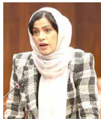
MP Basma Abdulkarim Mubarak

MP Basma Abdulkarim Mubarak said the proposal reflects the reality faced by many women living without family backing or secure accommodation.