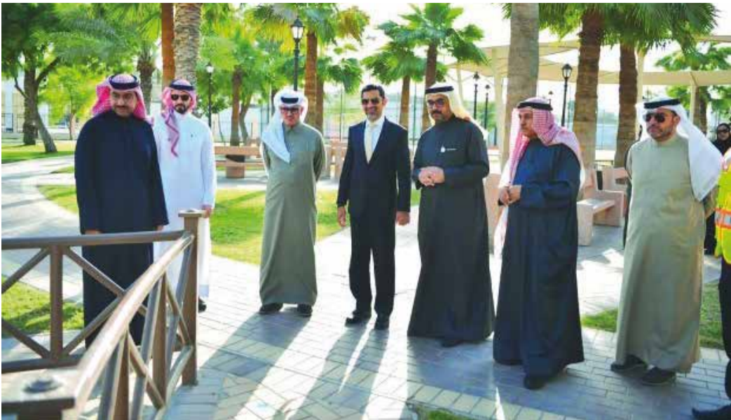
His Excellency Wael bin Nasser Al Mubarak, Minister of Municipalities Affairs and Agriculture, officially inaugurated the renovated Abu Ghazal Park in the Capital Governorate. Spanning 5,642 square meters, the renovation is part of the Ministry's initiative to upgrade public facilities and enhance urban greenery. The park now features state-of-the-art playgrounds, modern fitness equipment, a refurbished fountain, and an updated lighting system. To boost environmental appeal, the Ministry increased the number of trees and expanded green cover. During the ceremony, the Minister emphasized that the project aims to provide high-quality communal spaces that foster a healthy lifestyle for residents.