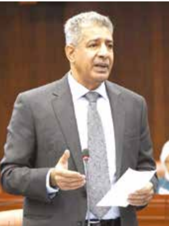
MP Munir Seroor

lacks a dedicated youth centre, despite what they describe as a growing youth cohort and a range of talents.