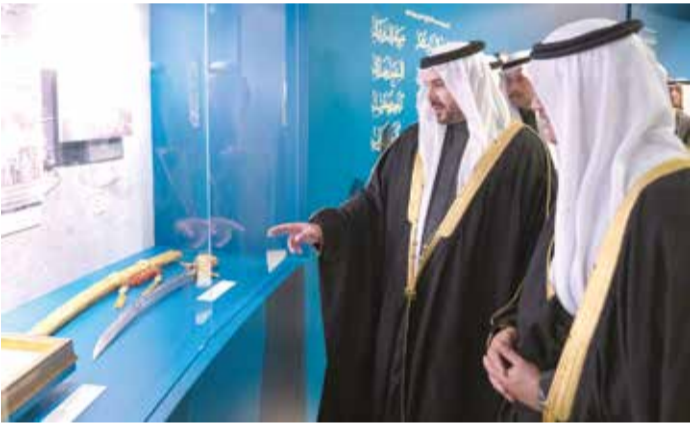
HH Shaikh Mohammed bin Salman bin Hamad Al Khalifa at the event

HH Shaikh Mohammed bin Salman affirmed the importance of documenting the lives of important figures that have contributed to the Kingdom's development, led by His Majesty King Hamad bin Isa Al Khalifa and supported by the directives of His Royal Highness Prince Salman bin Hamad