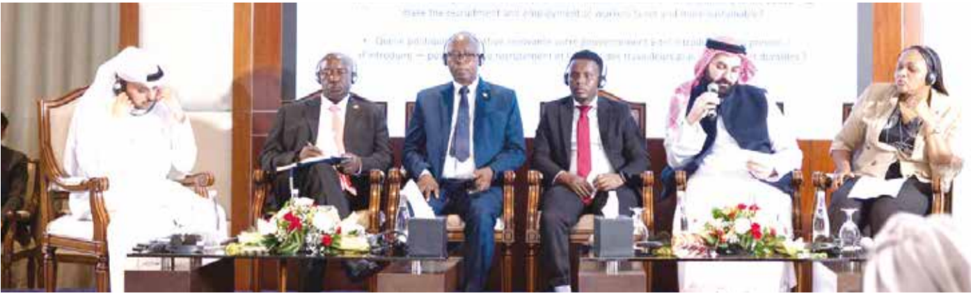
Participants from GCC countries and the East and Horn of Africa

Through interactive sessions, panel discussions, and network-