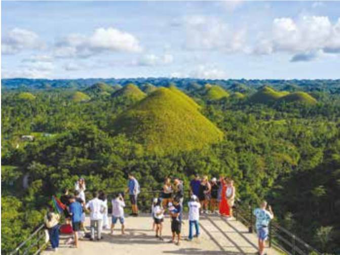
Tourists looking at the iconic Chocolate Hills on Bohol Island in Central Visayas province in the Philippines.