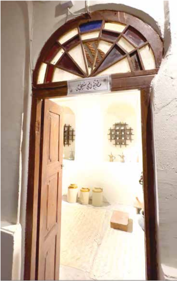
Modern walls rise but Beit Al Qusair stands to carry memory within

For generations, Beit Al Qusair was known for its open doors. Separate majlis spaces for men and women formed the social heart of the house, shaping daily