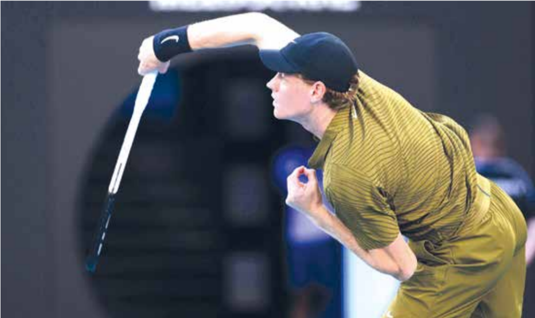
Italy's Jannik Sinner serves to France's Hugo Gaston

Jannik Sinner barely broke sweat in launching his quest to win a third Australian Open in a row yesterday as Naomi Osaka stole the show with a bold fashion statement. Popular Frenchman Gael Monfils meanwhile bid farewell to Melbourne Park with an epic defeat and thanks for “an amazing ride”. The Italian Sinner strolled into round two when French opponent Hugo Gaston retired on Rod Laver Arena with the second seed in full control at 6-2, 6-1. Gaston slumped to his chair and shook his head as his Australian Open ended in distress. Two-time reigning champion Sinner said it was not how he wanted to win, but was pleased with his night’s work. “I knew from the beginning that I had to play a very high level and was trying to be as aggressive as possible, which I’ve done,” he said. Should he win three titles in a row in Melbourne, Sinner would join Novak Djokovic as the only men in the Open era to do so. Great entertainer Monfils was bundled out in the first round in a brave goodbye to a tournament