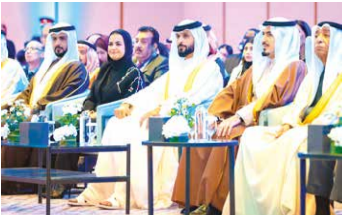
HH Shaikh Nasser attends the ceremony

The event was also attended by Her Excellency Rawan bint Najib Tawfiqi, Minister of Youth Affairs, alongside a number of Their Excellencies, Their Highnesses, officials, and