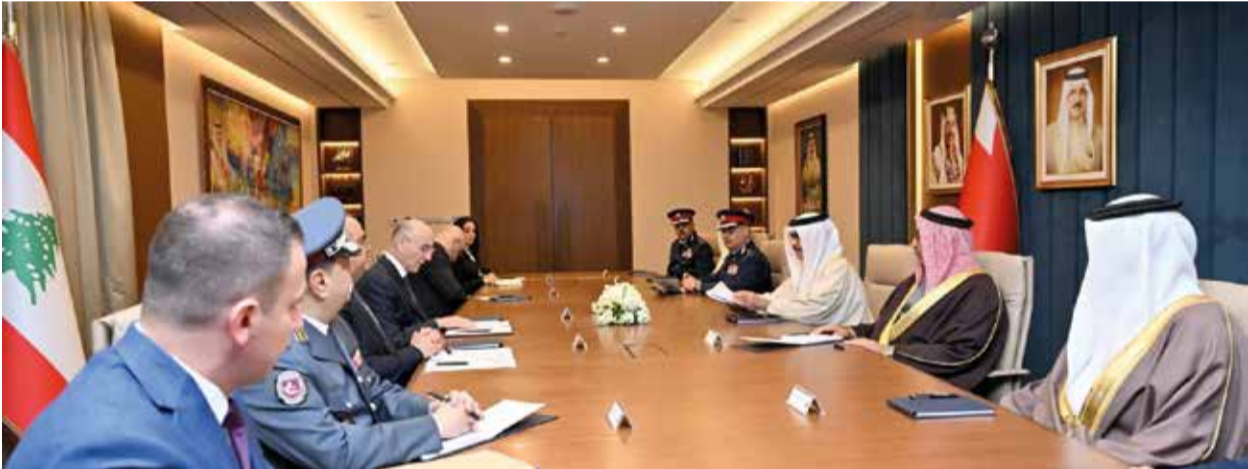
Bahrain's Minister of Interior, HH Shaikh Rashid bin Abdullah Al Khalifa, hosted Lebanese Minister of Interior and Municipalities, Ahmed Hajjar, to discuss enhancing security coordination. During the meeting at the Police Fort, Shaikh Rashid reaffirmed Bahrain's support for Lebanon's sovereignty and stability. The discussions focused on strengthening joint Arab security efforts and improving performance to face regional challenges. Both ministers emphasized the importance of exchanging expertise and developing modern mechanisms for cooperation. Minister Hajjar praised the strong bilateral ties and expressed his keenness to modernize joint security initiatives.