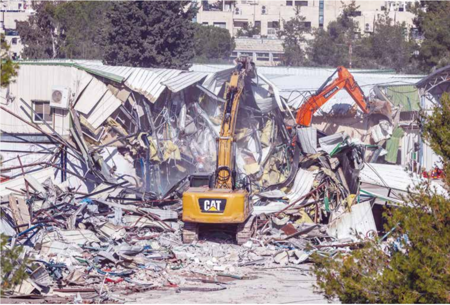
Machinery demolishing a structure inside the headquarters of the United Nations Relief and Works Agency (UNRWA) in the Sheikh Jarrah neighbourhood of Israeli-annexed east Jerusalem

The compound has been empty of UNRWA staff since January 2025