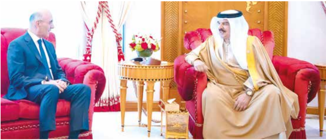
HM the King with H.E. Ahmed Mohammed Hajjar

During the meeting, HM King Hamad highlighted that such visits reflect the shared commitment to strengthening coordination and joint action, particularly in the security sector, to achieve common benefit.