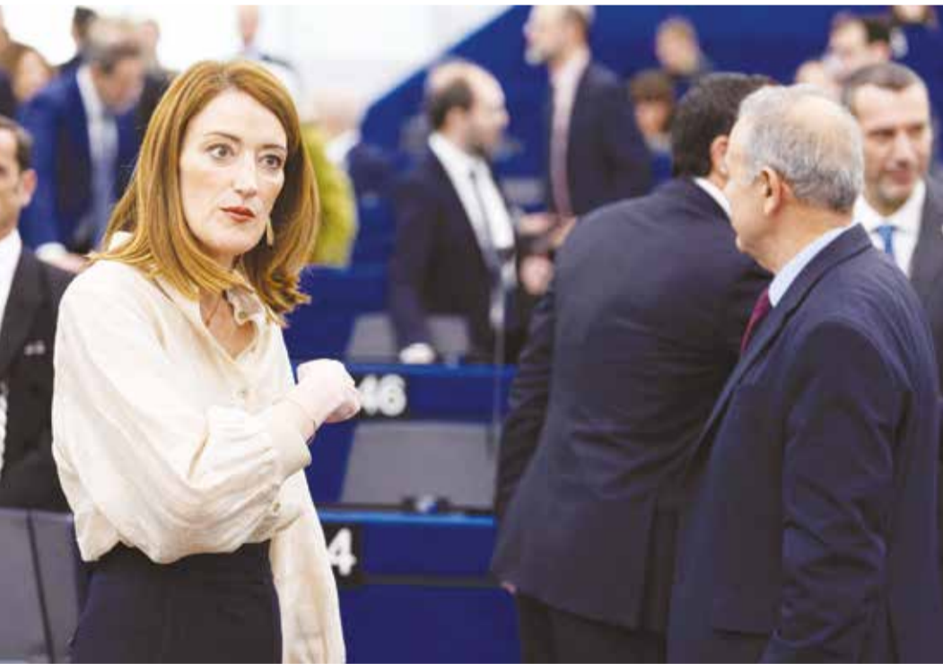
European Parliament President Roberta Metsola arrives prior to the presentation of the programme of the Cypriot presidency of the Council of the European Union during a plenary session at the European Parliament in Strasbourg, eastern France

EU lawmakers have agreed to hold off ratifying a key trade deal with the United States following President Donald Trump's tariff threats over Greenland, the main political groups said yesterday. The warning shot from the European Parliament comes as the 27-nation bloc weighs how hard to hit back if Trump follows through against Washington's long-standing allies. The parliament was planning