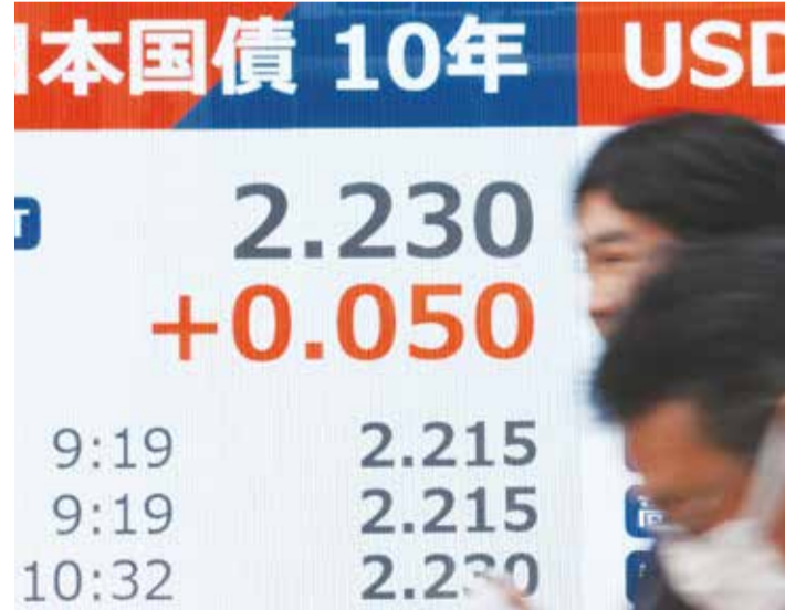
An electronic quotation board displays 10-year government bonds, an index of long-term interest rates on the Tokyo bond market, in Tokyo