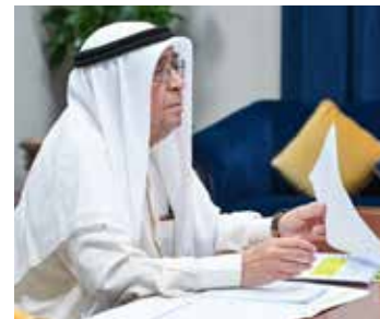
HH Deputy Premier during the virtual discussion

A report by Supreme Committee for Information and Communication Technology (ICT) also showed that 83 e-services have been developed last year, an increase of 108 per cent compared to previous years.