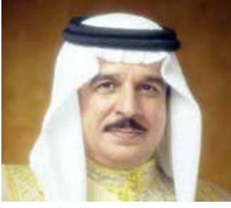
HM the King mutual respect.

HM the King expressed deep pride in the longstanding historic relations and solid partnership spanning 120 years, based on strong friendship and