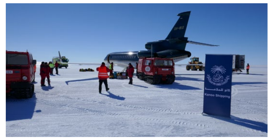
The Seatrade Middle East & Africa Ship Agent of the year in 2018 & 2019, provides a range of services to support national bases in Antarctica