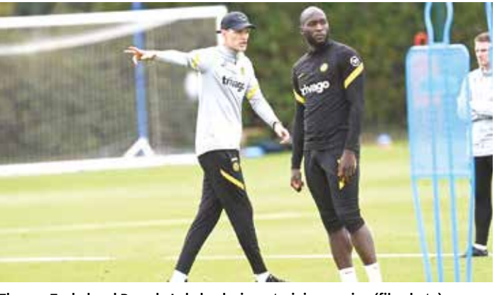
Thomas Tuchel and Romelu Lukaku during a training session (file photo)

"This will increase every day because we are in the process of I feel Romelu is a bit overplayed. including England's Mason