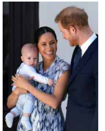
Meghan and Prince Harry with their child

“Their great grandmother is the Queen of England, and I think it's important for them to know that they have two families and eventually they're going to grow up and they're going to want to know more about them”