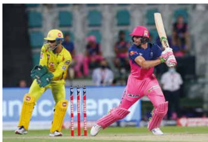
Jos Buttler (R) of Rajasthan plays a shot as MS dhoni of Chennai looks on

Smith, struggling to get runs, labored to an unbeaten 26 off 34 deliveries but hung in with