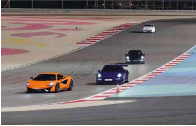
Participants steer their cars at BIC