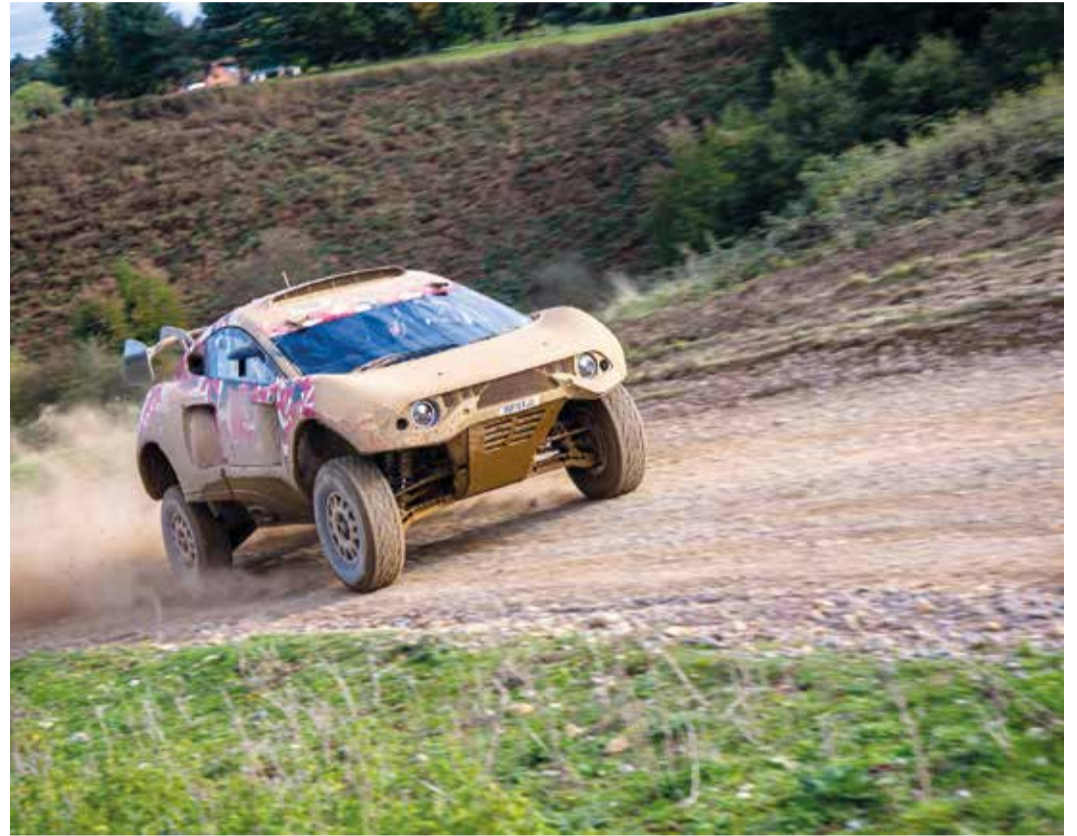
BRX's bespoke Dakar Rally T1 car during the test

BRX Driver, Sebastien Loeb, commented: "I managed to get a day testing the new car and I