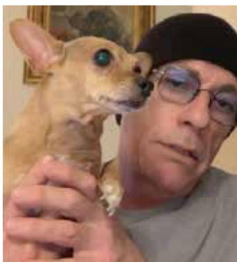
Jean-Claude Van Damme with his dog

The dog named Raya was sold to new owners in Norway in September but officials there would not register her because