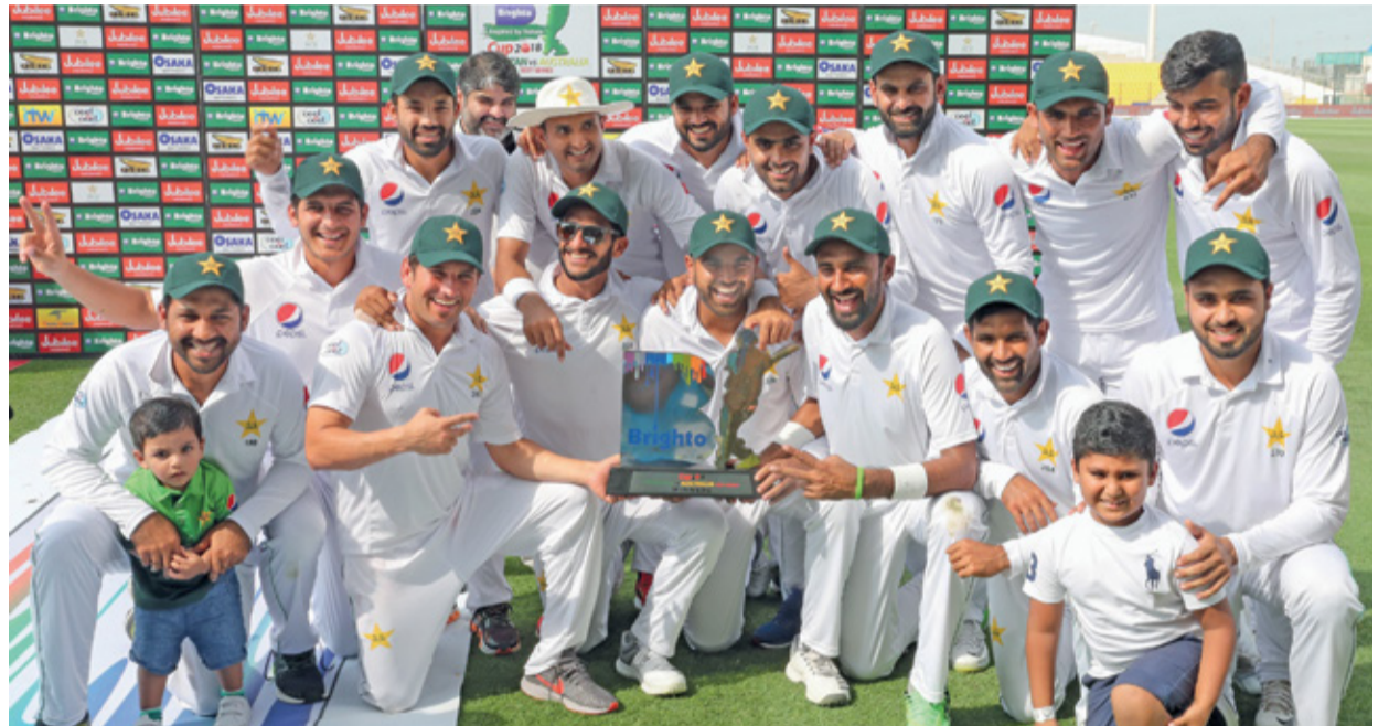
Pakistan's cricket team celebrates at the end of day four of the second Test cricket match between Australia and Pakistan at Sheikh Zayed stadium in Abu Dhabi

Abbas had jolted Australia with four wickets