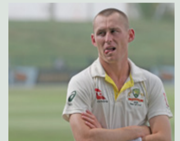
Australian cricketer Marnus Labuschagne gestures as Pakistan team is presented with the series trophy

Result: Pakistan win by 373 runs, take series 1-0