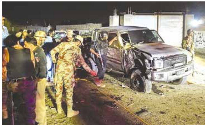
Security personnel inspect a damaged vehicle