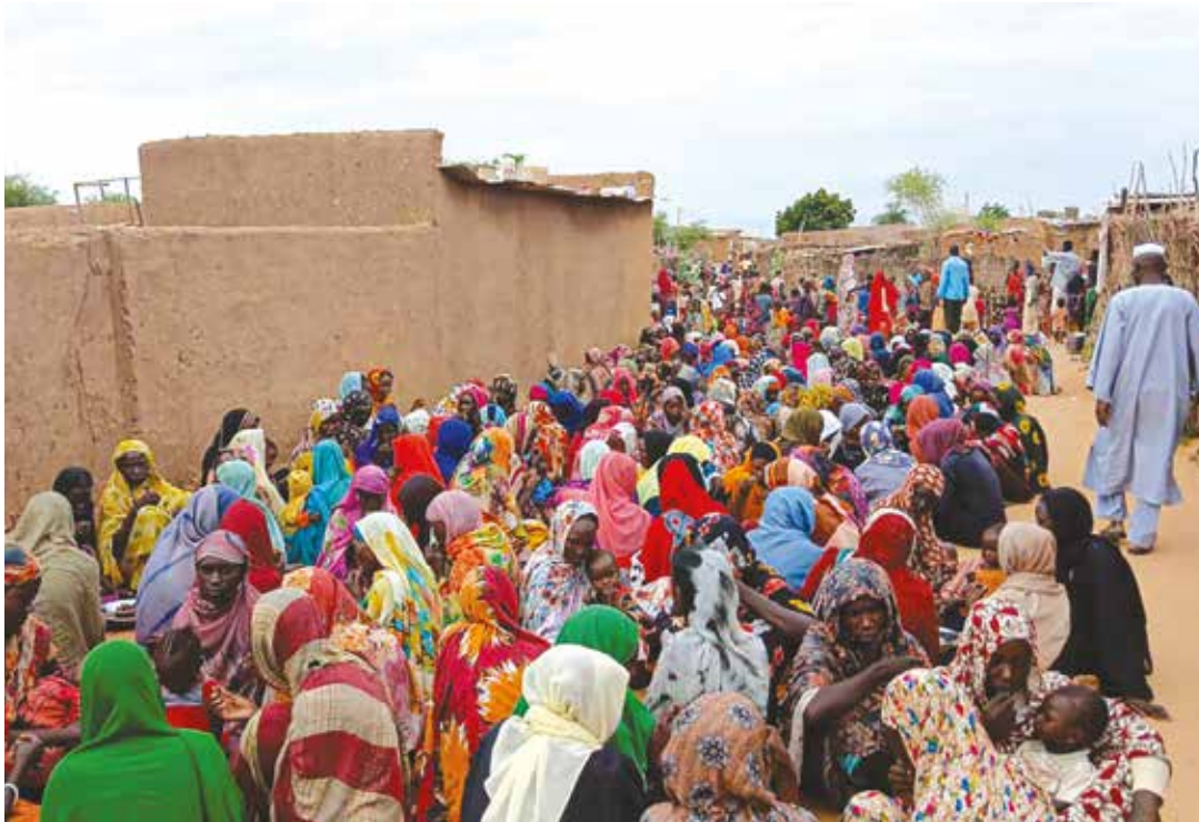
Sudanese residents gather to receive free meals in Al Fasher in Darfur region

der paramilitary siege for about 18 months, is the final state capital in Darfur still under the control of Sudan’s army, which has been locked in a devastating war with the RSF since April 2023.