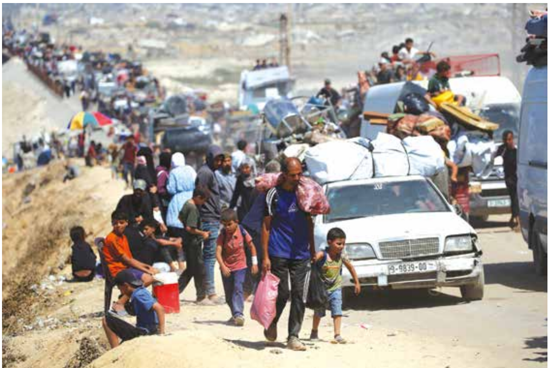
Palestinians from Gaza City move southwards with their belongings, on the coastal road near the Nuseirat refugee camp

Yesterday, the military’s Arabic-language spokesman announced the closure of a temporary evacuation route opened