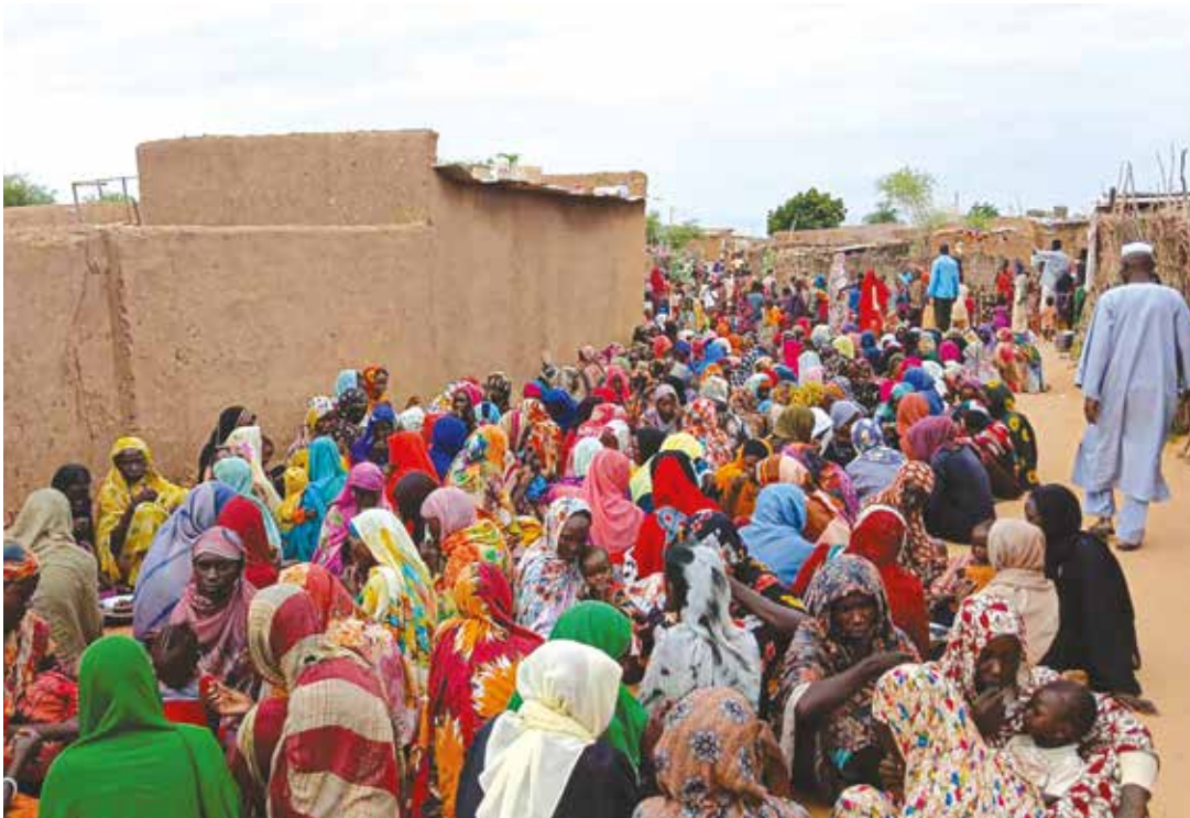
Sudanese residents gather to receive free meals in Al Fasher in Darfur region

der paramilitary siege for about 18 months, is the final state capital in Darfur still under the control of Sudan's army, which has been locked in a devastating war with the RSF since April 2023.