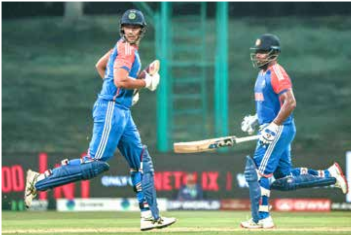
India's Shivam Dube (L) and Sanju Samson run between the wickets

Sanju Samson anchored the innings with a composed 56 off 45 balls, while opener Abhishek Sharma blasted 38 from just 15 deliveries to give the start momentum. Quick cameos from Axar Patel (26 off 13) and Tilak Varma (29 off 18) pushed India close to the 190-mark