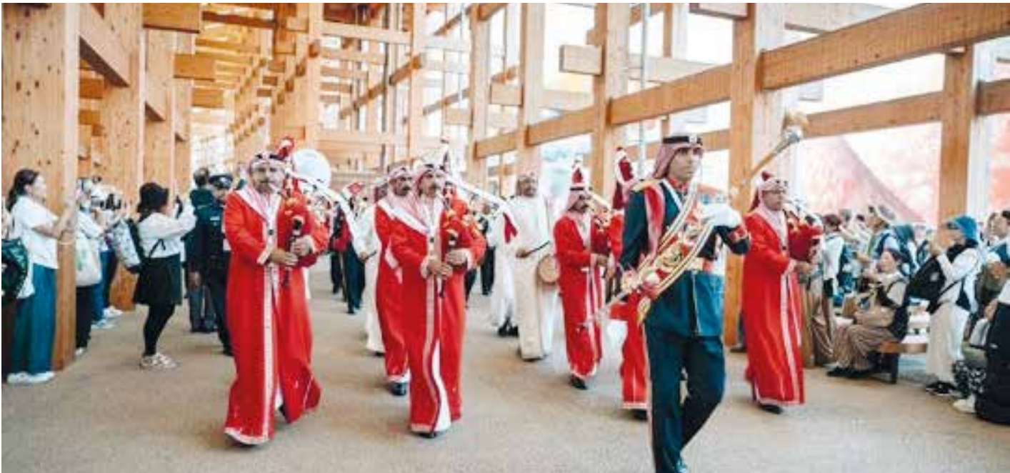
TDT | Manama

The Police Band made a notable international impression during its participation in Expo 2025 Osaka. Following the directives of General Shaikh Rashid bin Abdullah Al Khalifa, Minister of Interior, the band delivered performances that fused traditional police music with authentic Bahraini folk melodies, highlighting Bahrain's rich cultural heritage and artistic excellence. The high-level shows reflected the band's skill and