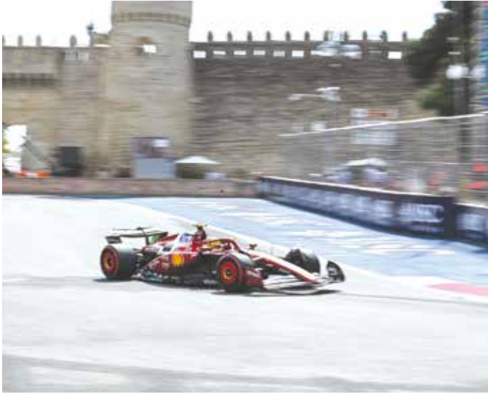
Ferrari's British driver Lewis Hamilton drives during a practice session

Russell was third, almost half a second adrift, ahead of his team-mate Kimi Antonelli, Oliver Bearman of Haas and four-