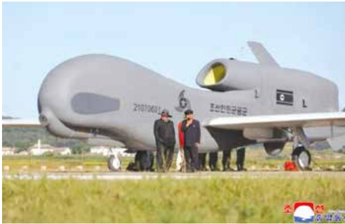
North Korea’s leader Kim Jong Un (L) attending the performance test of unmanned strategic reconnaissance aircraft

◆ Russian Foreign Minister Sergei Lavrov will meet US Secretary of State Marco Rubio on the sidelines of the United Nations General Assembly next week, Russian state media cited Moscow’s UN envoy as saying yesterday. “They will discuss an entire range of issues, both bilateral and multilateral. There is no specific agenda yet, but a meeting is being planned,” said Russia’s permanent representative at the UN, Vasily Nebenzya, according to the RIA Novosti news agency.