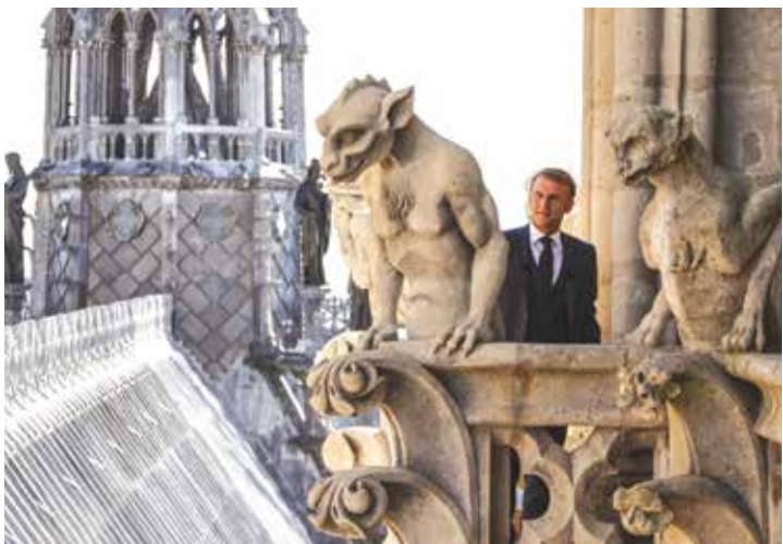
France’s President Emmanuel Macron looks at the gargoyles as he visits Notre-Dame de Paris Cathedral

Their reopening marks another landmark in the vast reconstruction process which is still ongoing even after the December 7, 2024 reopening of the cathe-