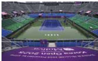
A view of the wet court

Six-time Grand Slam champion Swiatek opened her campaign with a 6-3, 6-2 win over