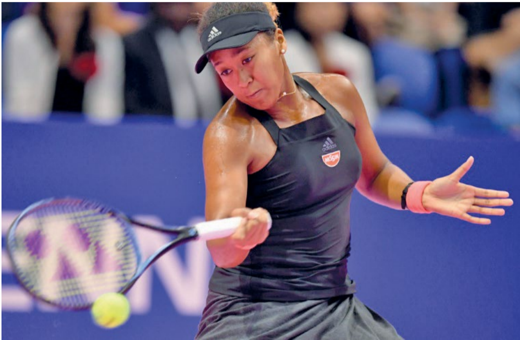
Osaka hits a return against Cibulkova

"I'm not really thinking about winning the US Open," added Japan's latest sporting celebrity, who has a Japanese