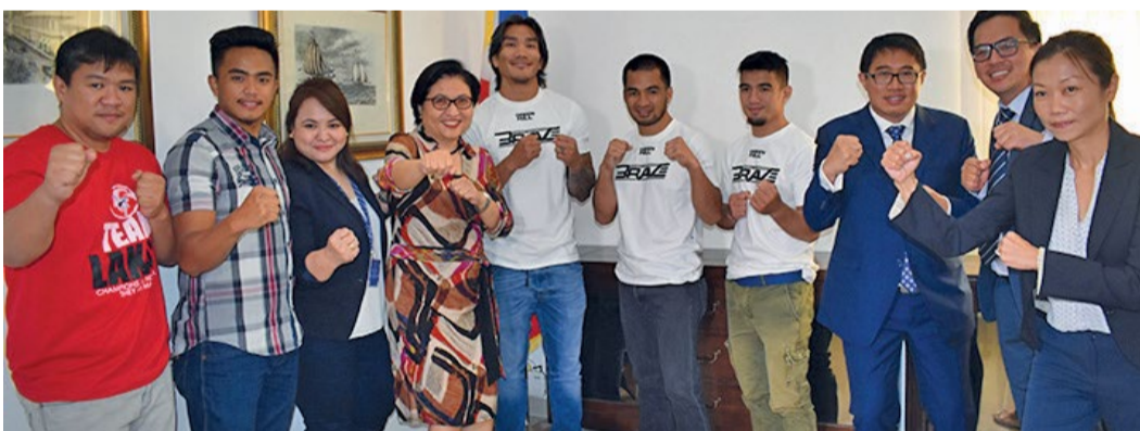
Athletes visit Philippines Embassy in UAE

The three fighters, together with their coaches were invited to the Embassy and met the Ambassador of Philippines to