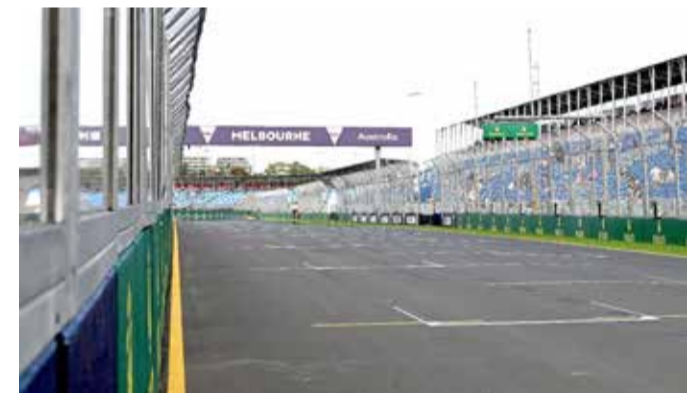
A general view of the Albert Park Circuit in Melbourne