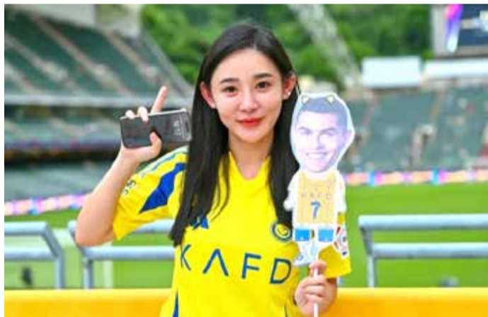
A supporter of Al-Nassr's Cristiano Ronaldo poses before the Saudi Super Cup semi-final football match between Al-Nassr and Al-Ittihad at the Hong Kong Stadium

"Ronaldo, Ronaldo," rang out from the moment that he came out to warm up on a sweltering