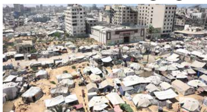
Tents housing displaced Palestinians in Gaza City