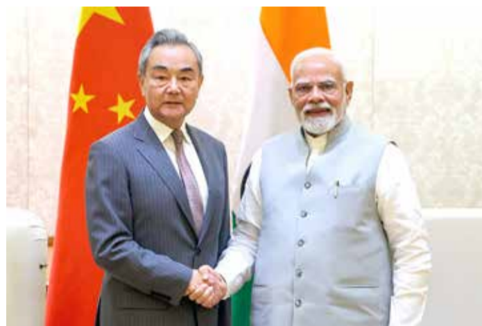
India's Prime Minister Narendra Modi shaking hands with Beijing's Foreign Minister Wang Yi during a bilateral meeting in New Delhi

Doval said, speaking of "new energy" in diplomatic ties.