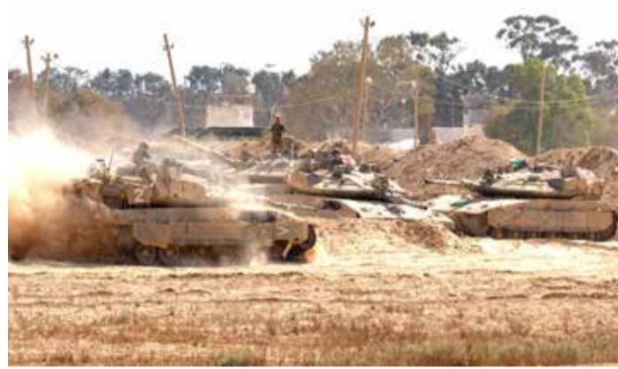
Israeli troops deployed in the bordering area of the besieged Palestinian territory

By announcing the move, France was set to join a growing list of nations to recognise statehood for the Palestinians since Israel launched a bombardment of Gaza nearly two years ago