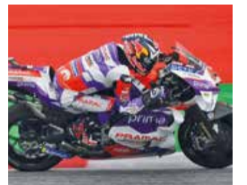
Johann Zarco in action

Zarco topped qualifying for the last race at Silverstone but then crashed out on lap five. "Happy with this first day,"