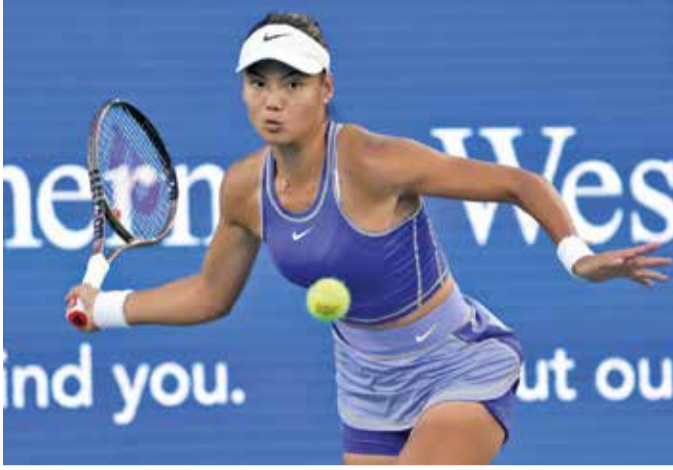
Emma Raducanu in action | Cincinnati

Emma Raducanu will head into her US Open title defence in just over a week relieved that she is swinging freely again and playing the same brand of attacking tennis that took her to a maiden Grand Slam title last year.