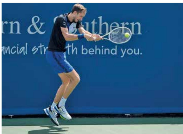
Daniil Medvedev returns a shot during his match against Denis Shapovalov

” "I got a lot of break opportunities. Broke first in the first set. Served pretty well even in the game where I lost my serve. In general, happy with my level and looking forward to the next matches