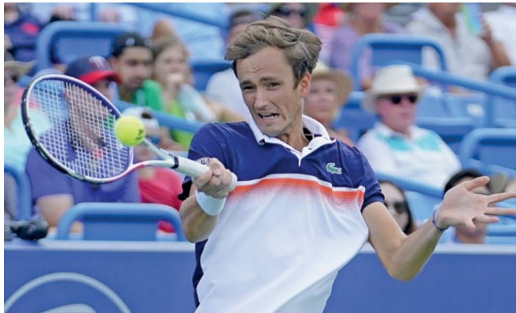
Russia's Daniil Medvedev returns to Belgium's David Goffin

After his full-on post-Wimbledon schedule, the winner admitted: