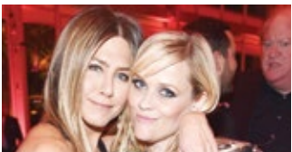
Jennifer Aniston and Reese Witherspoon

The trailer of ‘The Morning Show’, featuring Oscar-winning actor Reese Witherspoon, and Emmy Award winners Jennifer Aniston and Steve Carell, is finally here. Apple released the trailer of the show, which will appear on the tech giant’s Apple TV+, the new streaming platform from the makers of iPhone. Apple TV shared the intriguing trailer on its official YouTube handle. The recently released trailer has it all from Aniston and Witherspoon’s facing off to Carell’s breakdown. In the trailer, Aniston’s character declares it’s going to be a “new era” at the morning talk show. An anchor on the show-within-the-show, she addresses her audience alone at the news desk, bringing them “sad and upsetting news” about her co-host, played by Carell, who she says was fired after allegations were made against him.