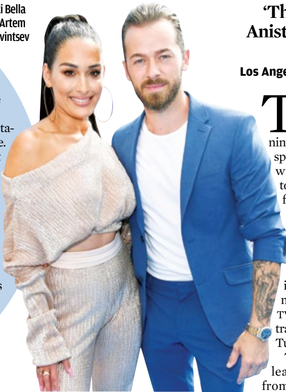
Nikki Bella and Artem Chigvintsev

Nikki Bella after dating John Cena is now thanking the “Universe” for giving Artem Chigvintsev in her life. In a recent photo that the ‘Total Bella’ star posted on Instagram, she and her now-boyfriend Chigvintsev can be seen totally in love. “Today is a new beginning for both Artem Chigvintsev and I. As I start a new amazing journey with Total Bellas and my life, my Artem Chigvintsev is starting the same,” the retired WWE star began her heartfelt post. “And I am so excited for him to be on this journey with me. I’m thankful for him to showcase his life, love, ups, and downs not only for me but for my Bella Army and my Total Bellas viewers,” she added. The 37-year-old professional dancer who is now expected to make more and more TV appearances with the 35-year-old reality TV personality further continued saying that, “sometimes we have a door shut and we don’t understand why, but honestly there is always a reason. I have been through that. And not through that just as a break-up but through that professionally and personally. And when those other doors open they open SO big! Believe in God, the Universe, our Angels and so much greater beyond what we can see.”